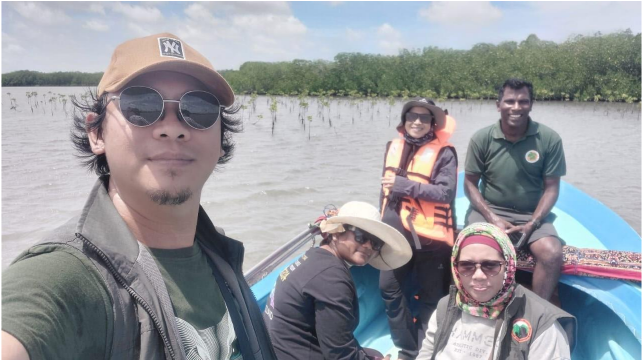
Out on the water to observe the mangroves and TCP's mangrove restoration project.