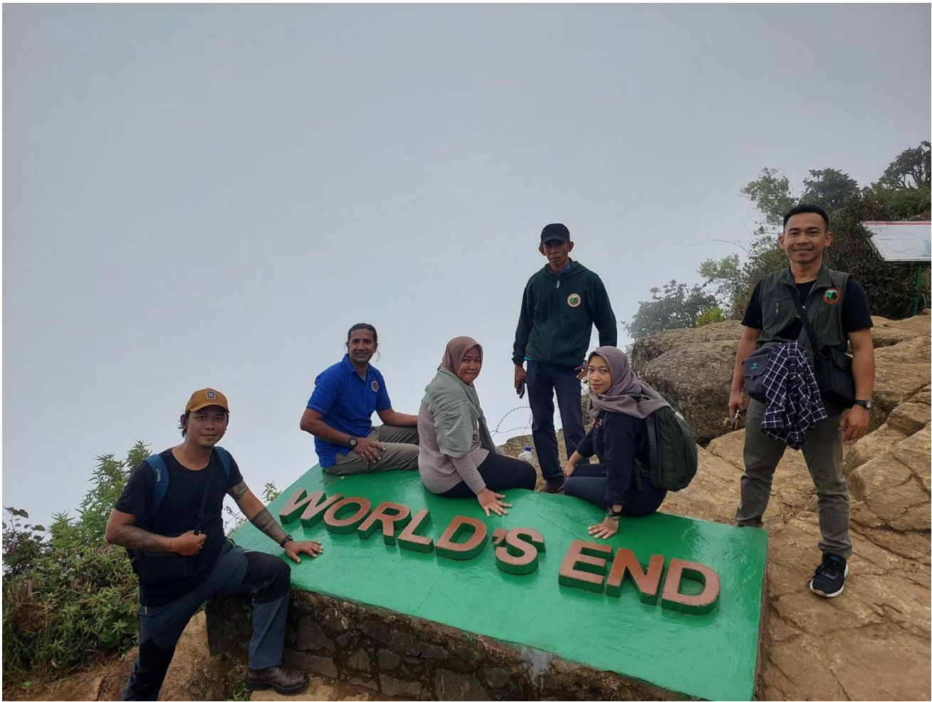
Exploring National Parks and incredible sights in Sri Lanka.

Our journey continued into the cool highlands of Nuwara Eliya, a mountain town located 1,868 meters above sea level. The city is often referred to as “Little England” due to its cool climate and scenery reminiscent of the English countryside. Nuwara Eliya is famous for its rolling green tea plantations, beautiful gardens, and still-preserved British colonial architecture. We then visited Victoria Park, one of the largest parks in Sri Lanka, where park managers explained how they preserve the diversity of the park while managing it as a popular tourist destination.