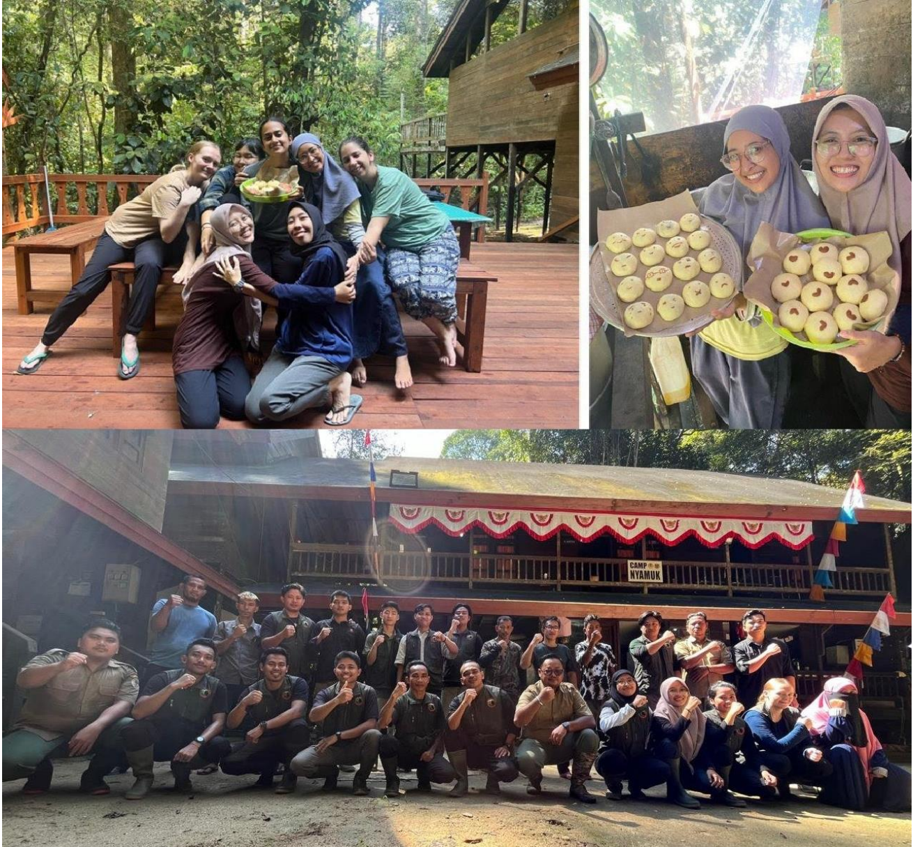
Fun times with the CPRS crew!!!