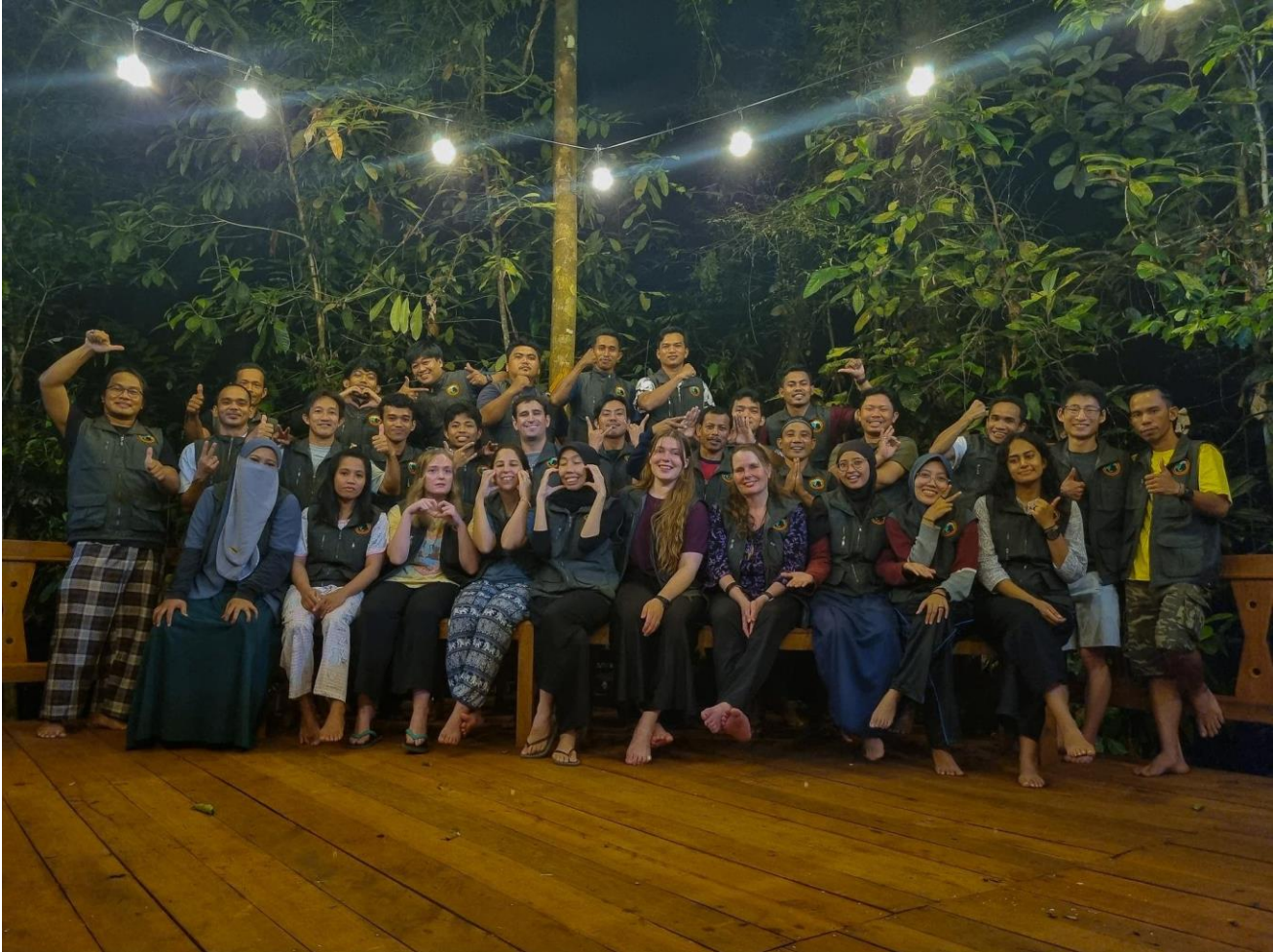
The research staff celebrate 30 years of orangutan research at Cabang Panti.

experienced before. As I've entered into the field of conservation, it didn't take long for me to realize that these are my people. I'm an extreme introvert, and always found it difficult to find people that I truly connected with. I'm so happy to say that I honestly love each and every person that I've met at the Cabang Panti Research Station, the Rangkong River Research Station, and the rest of the GPOCP/Yayasan Palung organization in Ketapang and Sukadana. Initially equipped only with my smile and a few basic Indonesian words and phrases, I still found it easy to befriend the generous and hard-working people that I've met. As my Indonesian vocabulary expands with the help of many understanding people at camp, I thoroughly enjoy learning more about the lives of my fellow conservationists and sharing more about myself as well.