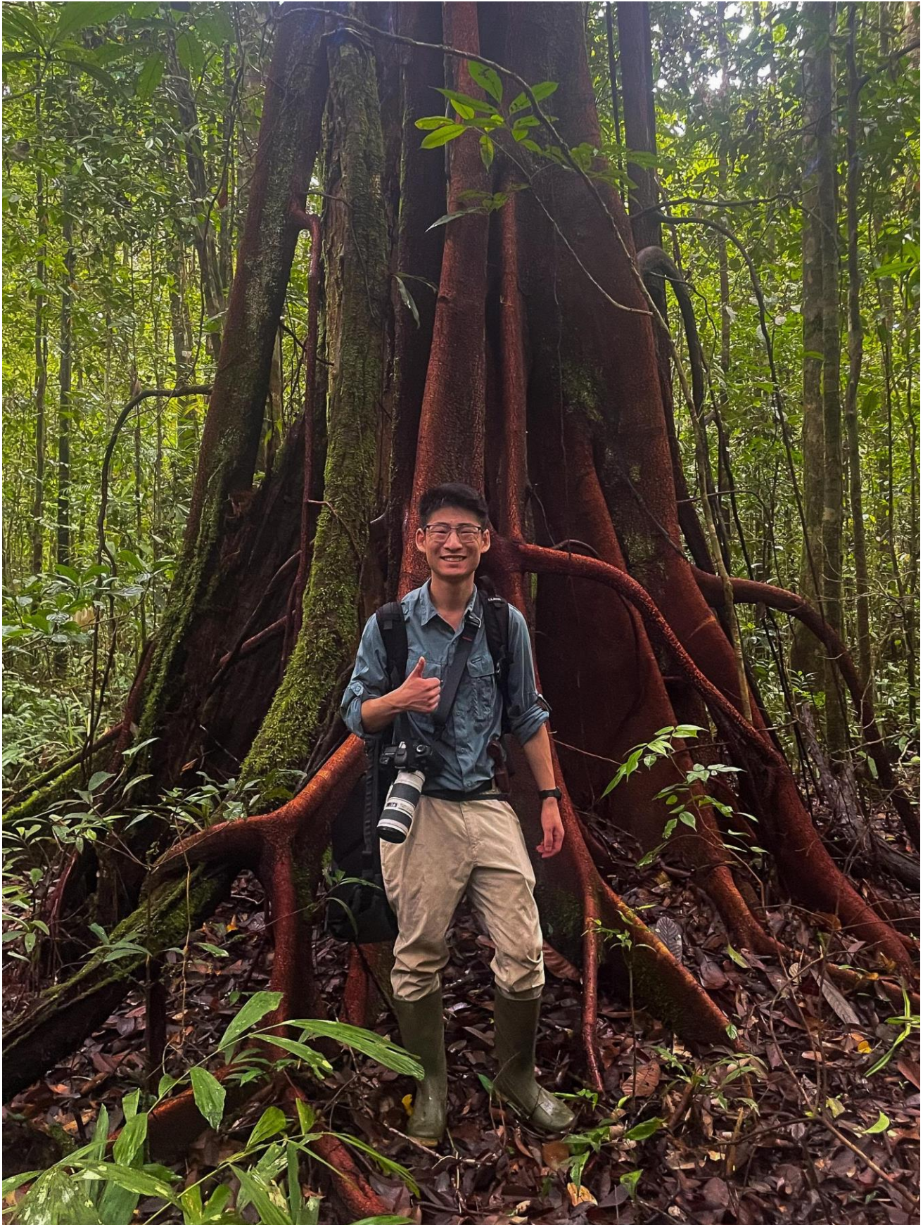
Jay stops by a tree while following an unflanged male orangutan, Tunjuk.

I halted my slow walk on a trail when a pair of small birds fluttered into my field of view and perched on the greenery that lines the path. I held my camera up, and they disappeared into the forest before I had the chance to snap a picture. I heard a loud crash off the trail behind me and crept along for a better view. If I didn't stop to try to photograph the birds, I would have walked right by this spectacular opportunity. From 30