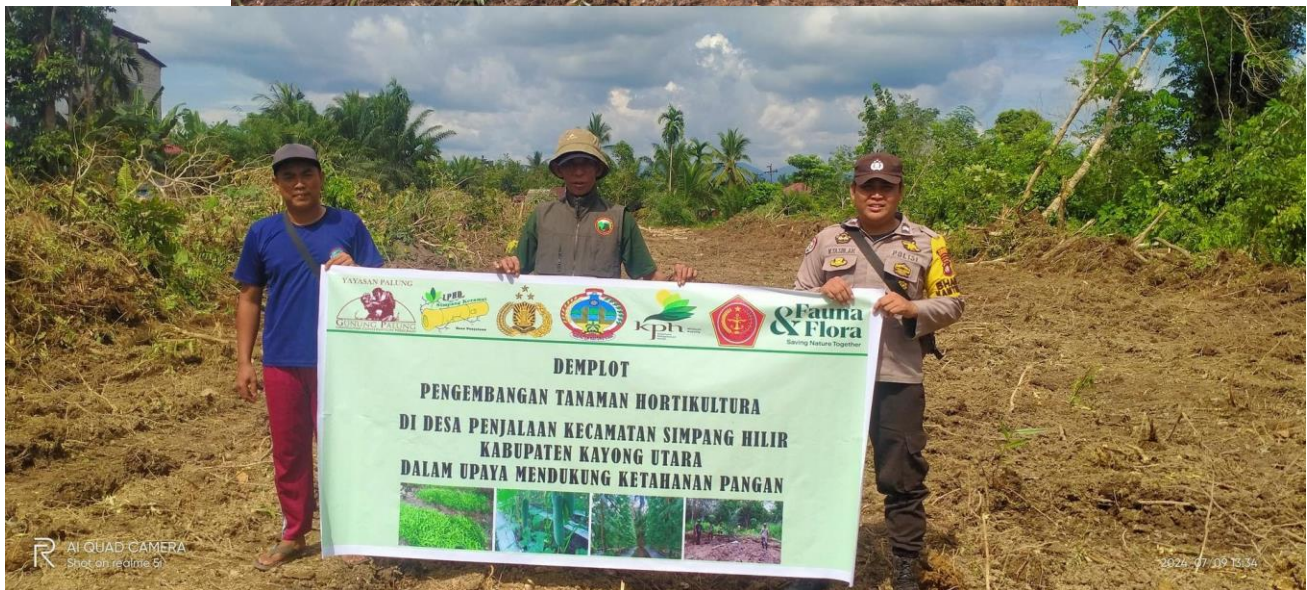
Clearing land without burning for a horticulture demonstration plot in Penjalaan Village.

In Padu Banjar Village, we created a horticultural plant demonstration plot using grass mulch as a plant bed cover. There are several benefits to this, including preventing farmers from burning land, preventing or slowing grass growth in the bed location, and maintaining soil moisture during the dry season, along with various other benefits. The development of horticultural crops is directly monitored and supervised by the Village Forest Management Unit (LPHD) in each village. GPOCP/Yayasan Palung village forest staff will continue to monitor the progress and development of these horticultural crop demonstration plots, noting the quantity of crops produced and the amount of revenue from sales.