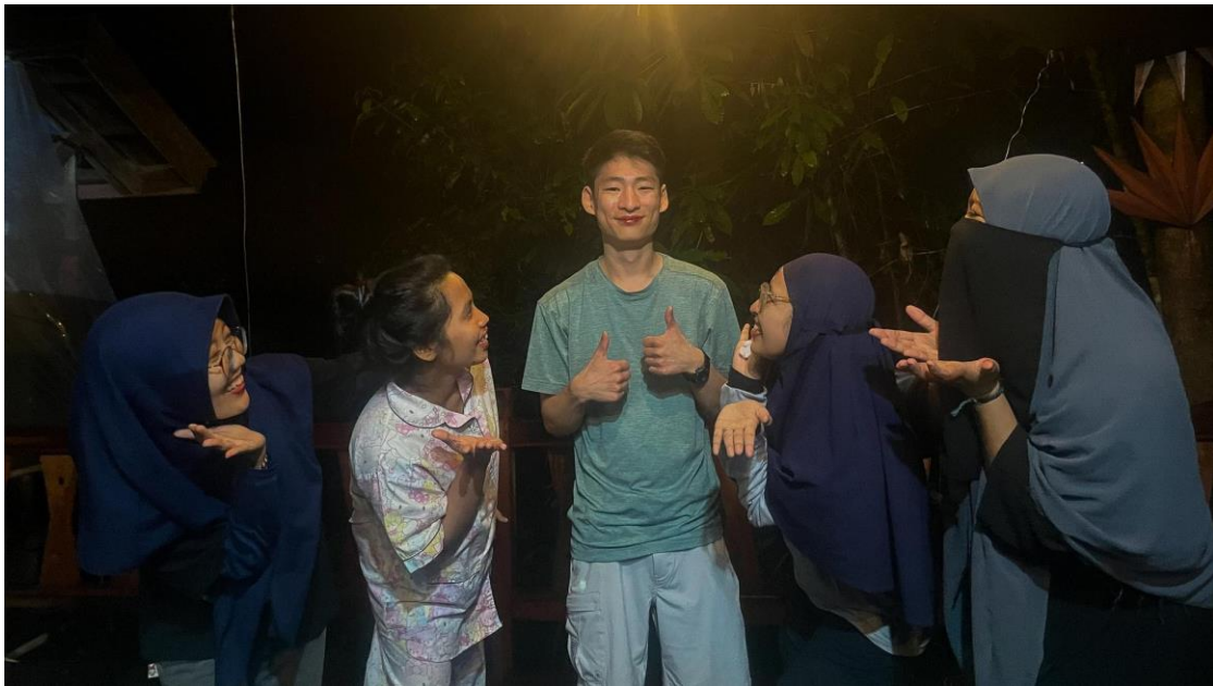
The participants of the dizzy makeup challenge on Indonesian Independence Day.