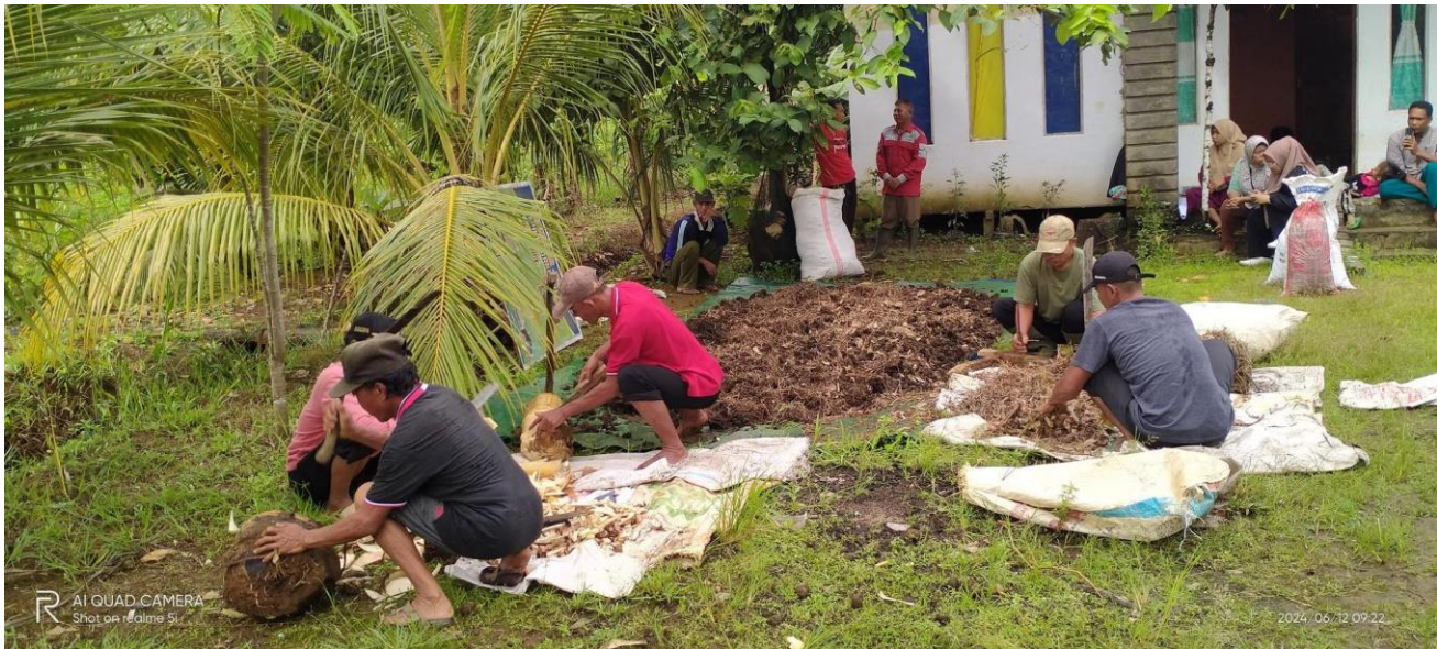
Workshop on creating organic fertilizer in Rantau Panjang Village.