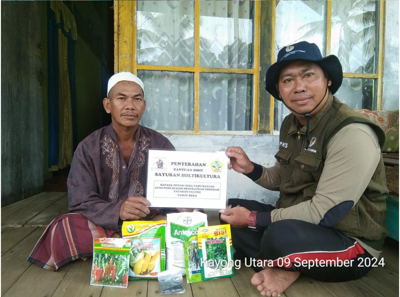
GPOCP/Yayasan Palung provides horticultural plant seed support to Village Forest farming groups.