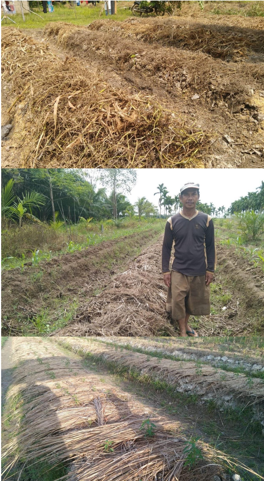
Clearing and cultivation of no-burn land for the development of horticultural crops in Padu Banjar Village.

After the training on making organic fertilizers, farmers are encouraged to make horticultural plots around the farmers' residences. There are several types of plants developed including chili, eggplant, long beans, cucumber, corn and more. GPOCP/Yayasan Palung provides the seeds for these plots.