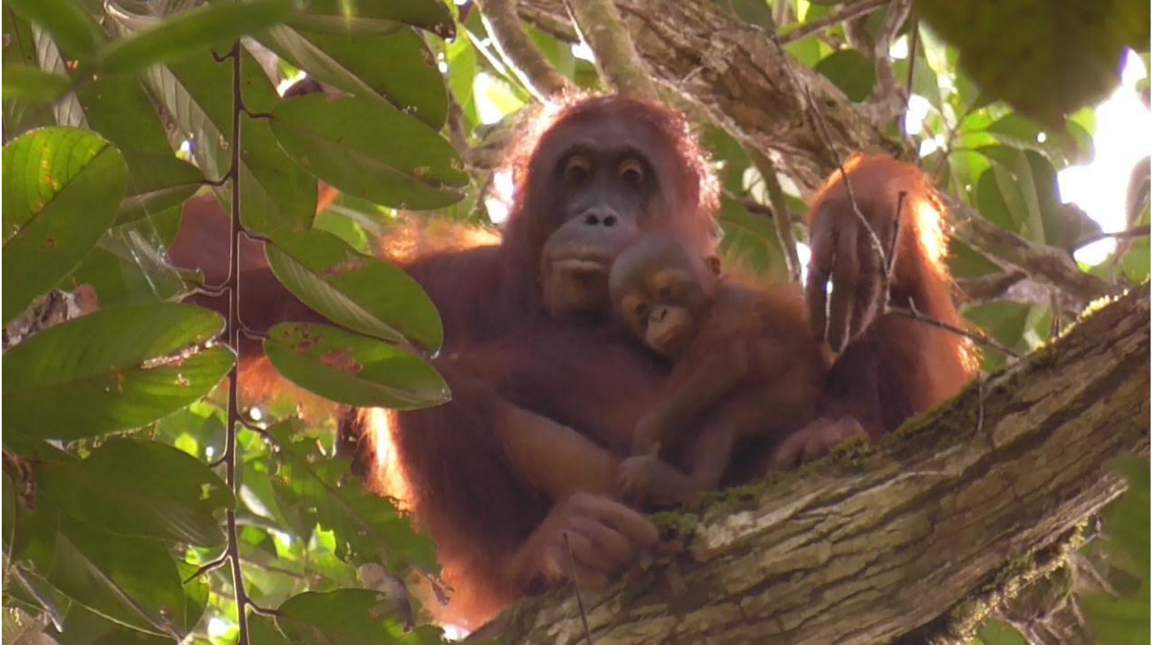
Berani, Bibi's grown-up daughter, and her new baby.

In 2023 we saw the official start to regular data collection at full capacity at the Rangkong River research site. We had worked long and hard on plans and logistics to initiate the study of the orangutans at the Rangkong satellite research camp. It is \pm 6 km from the Cabang Panti research station, and still within the bounds of Gunung Palung National Park. It is different in important ways, however, as the Rangkong area used to be a hotspot of illegal logging. The forest has regenerated here, but has different forest structure and plants in it, and we would like to know how orangutans deal with this different forest type. In early February 2023 we began searching for orangutans at the Rangkong. By February 6th, we began our first official orangutan follow at this new site. Natalie, our Program Coordinator at the time, met the mother and baby orangutans near the camp. She made a 'Hoo!' vocalization to signal the field assistants that she found an orangutan, and then the field assistants joined the orangutans until they built their night nest. We are so excited to see what our research at this site can tell us about how orangutans adapt to different levels of habitat disturbance. Already we see differences in the kinds of food available, which we expect to have implications for many aspects of orangutan behavior and biology.