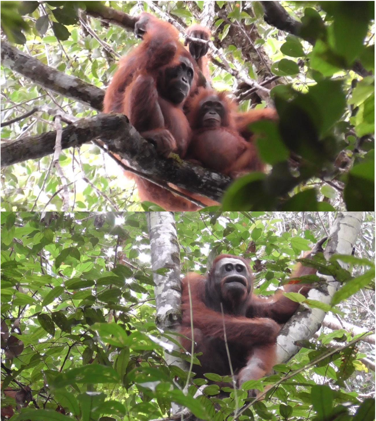
Bibi and Bayas (above) and the unflanged male, Juk (below) in early January 2023.

So, it was a strong start to the year for us! We were especially excited to find Berani and her new baby. The baby is still known only as IF11DEC23, which is the sort of temporary code an individual is given if they are new to us and have not been named yet. You may remember our article reporting the news of this birth in the December 2022 issue of Code RED. Berani is the daughter of the orangutan Bibi, so Berani is Bayas' older sister. We first found Berani with the brand-new infant on December 11, 2022, and for several days we made observations on the condition and behavior of Berani and the baby. Seeing them again right away in 2023 was a great way to track the development of the infant as well as Berani's behavior as a new mother. Berani, whose name translates to brave , appeared to be a very good mother and attentive to her first offspring, even though she was new at it. Berani has been followed since she herself was a baby, so it has been very exciting to watch this new milestone in her life.