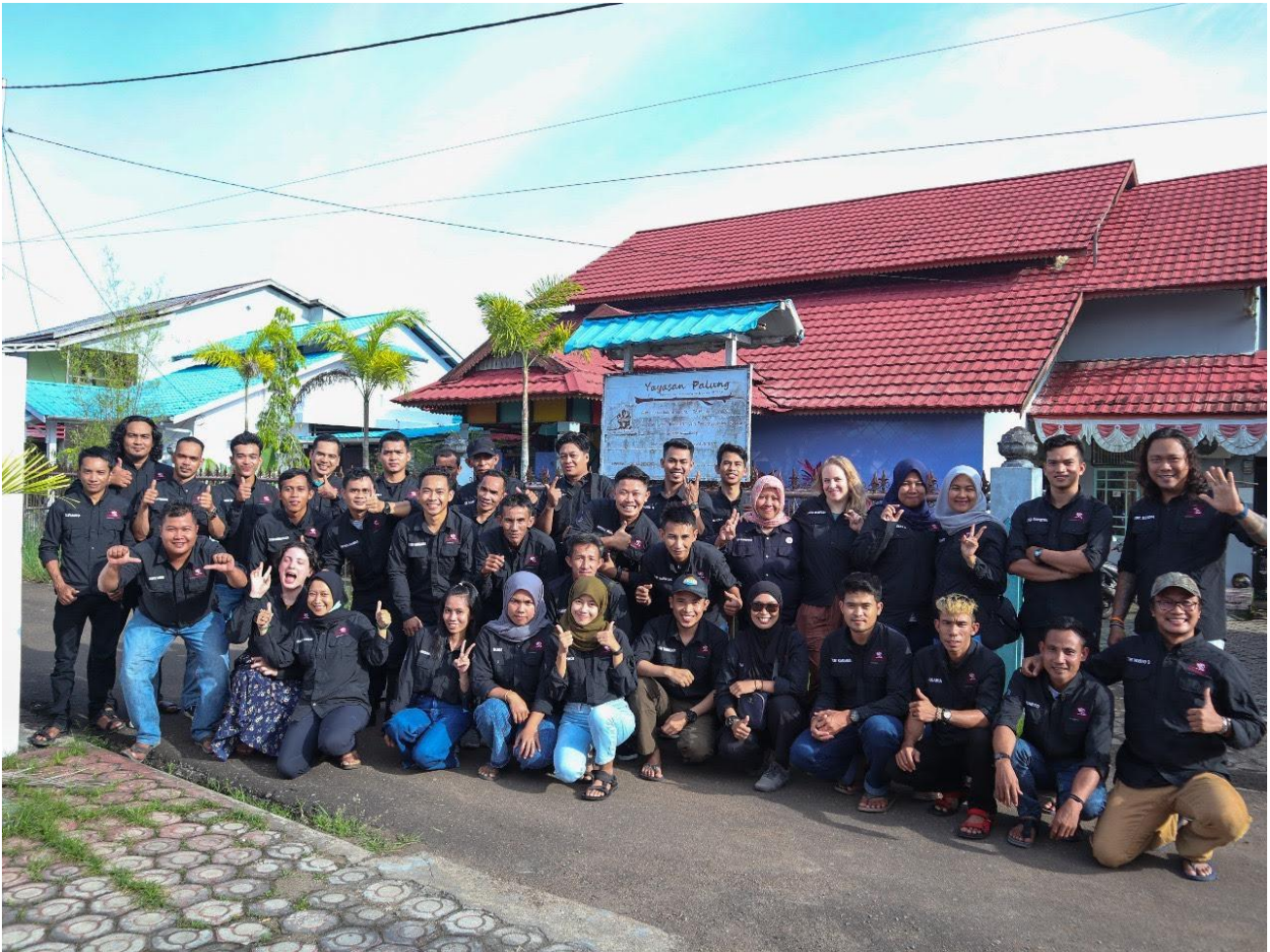
Last year's Annual Meeting in January 2023, the keluarga besar (big family) photo.