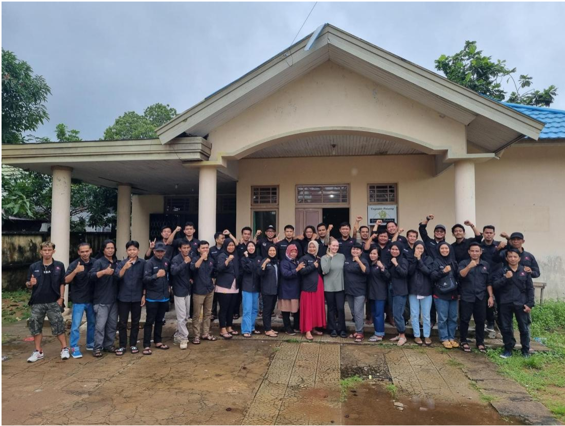
The keluarga besar at the end of this year's Annual Meeting.