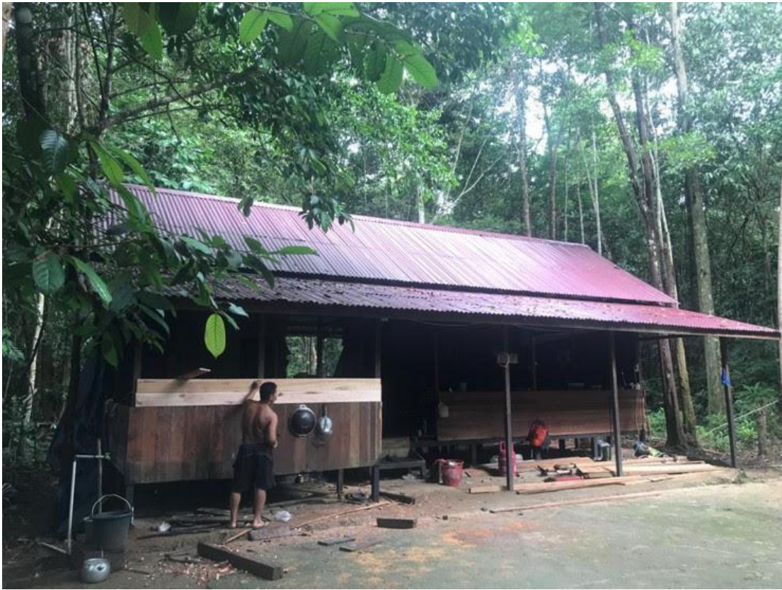
Repairs being made to the building at the Rangkong camp in preparation for full capacity research data collection there.