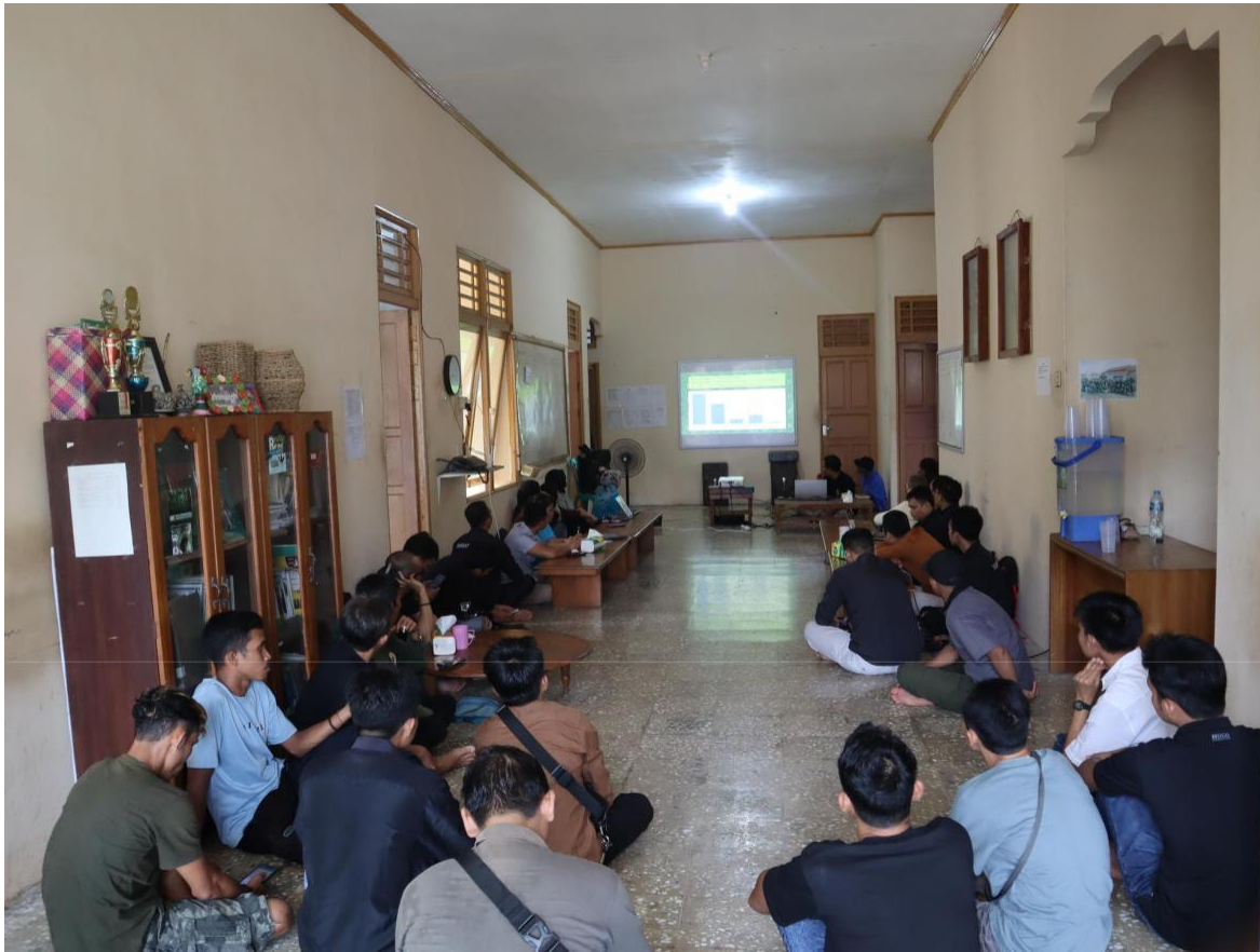
Day 1 of the Annual Meeting: The staff looks on as they listen to the accomplishments of their colleagues in 2023.

On the second day, we prepared a plan of activities that will be implemented in each program in 2024, including what will be achieved in support of the conservation of orangutans and their habitat. The activity plan that we compiled will be used to guide each program and focus our efforts in the field. In addition to this activity plan, each program also established what equipment, supplies, or other support they need to be successful, including what increased capacity is needed to support the implementation of these programs. We also reviewed the partner institutions that will collaborate with GPOCP/Yayasan Palung on different activities.