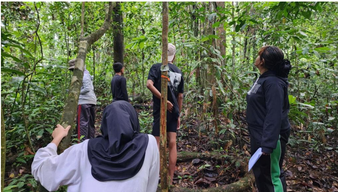
High school students make observations of forest animals and vegetation.