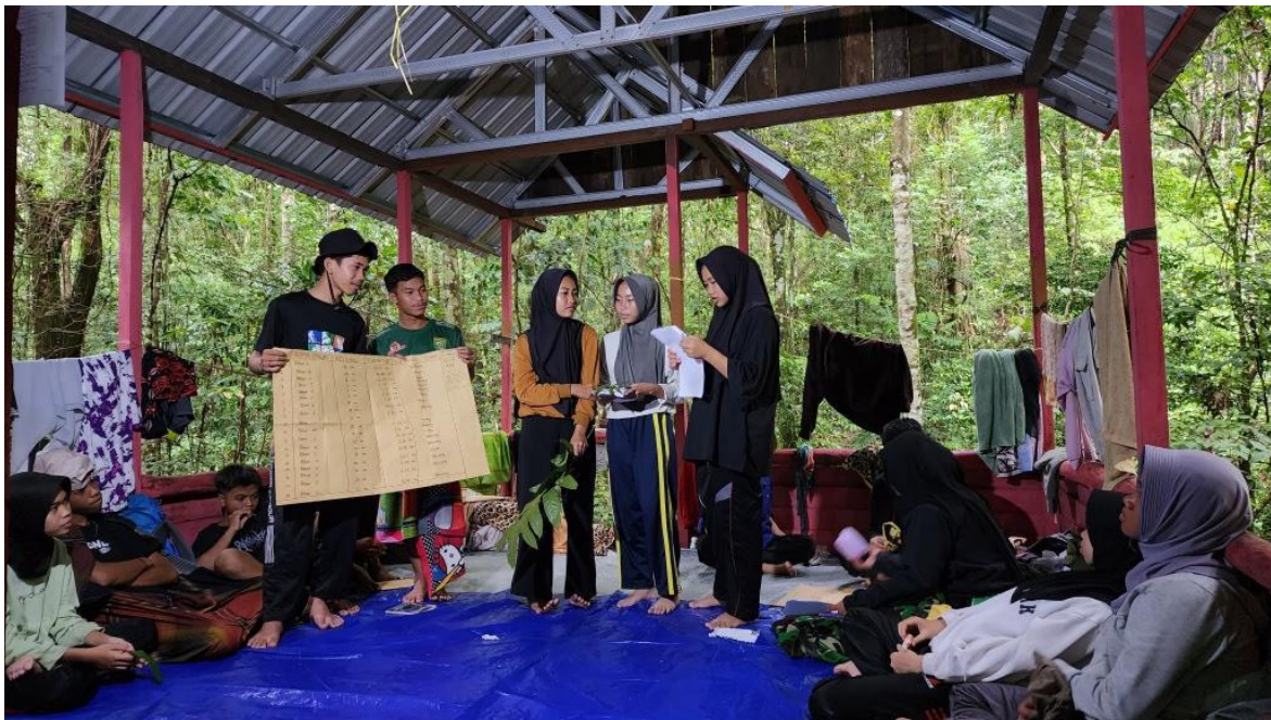
Student sharing their observations from their exploration and practice of field techniques in the forest.

For me as a leader on this trip, this was my second time encountering an orangutan in Lubuk Baji. The first experience was during a field trip with students from Ketapang in 2021. The encounter happened on the way home. We saw an orangutan female with her offspring climbing a tree. Lubuk Baji thus provides an important refuge where orangutans can play, climb, sleep, and look for food. Together, we need to protect this area and preserve all of Gunung Palung National Park for orangutans and the other creatures that live there.