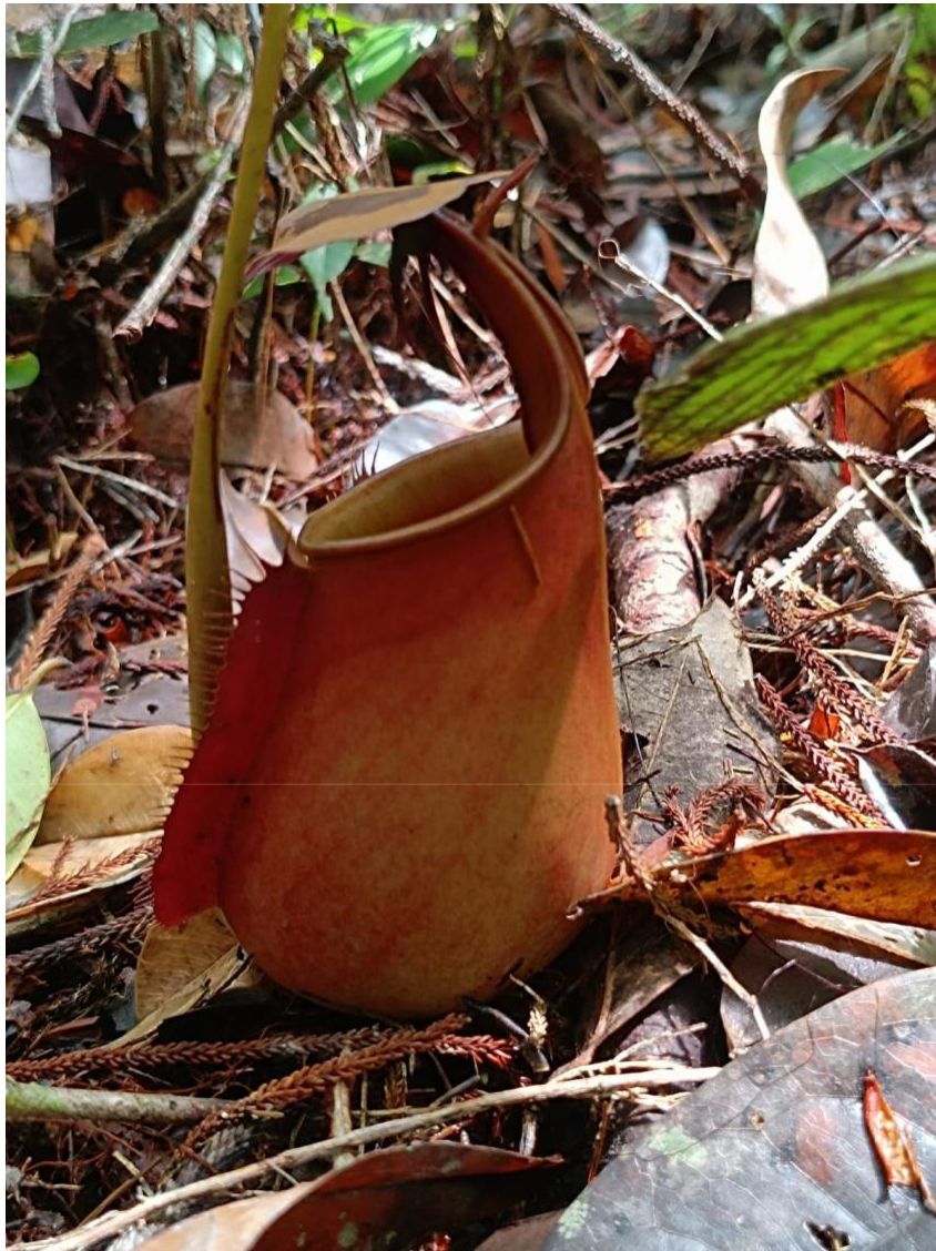
Group photo in front of the Rangkong (Hornbill) Camp and a Nepenthes bicalcarta pitcher plant.