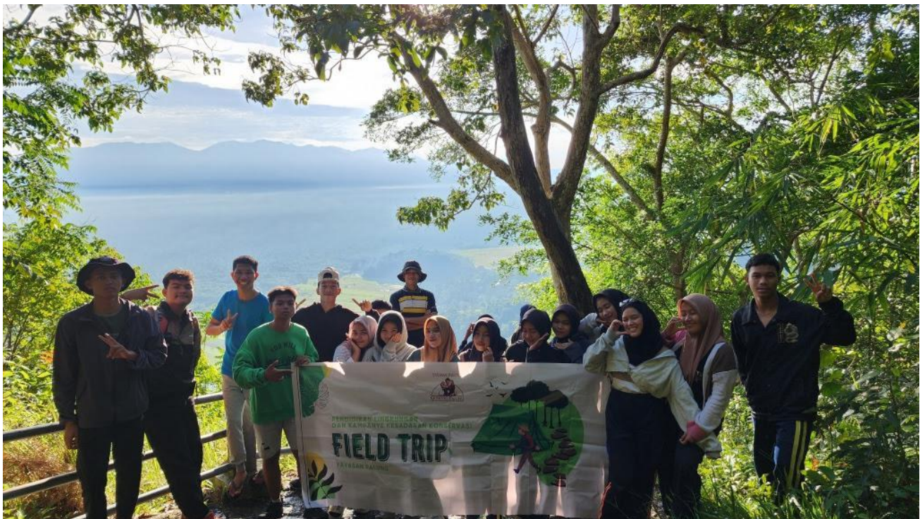
Group photo of the field trip participants from the scenic overlook at the top of the mountain.

For me as a leader on this trip, this was my second time encountering an orangutan in Lubuk Baji. The first experience was during a field trip with students from Ketapang in 2021. The encounter happened on the way home. We saw an orangutan female with her offspring climbing a tree. Lubuk Baji thus provides an important refuge where orangutans can play, climb, sleep, and look for food. Together, we need to protect this area and preserve all of Gunung Palung National Park for orangutans and the other creatures that live there.