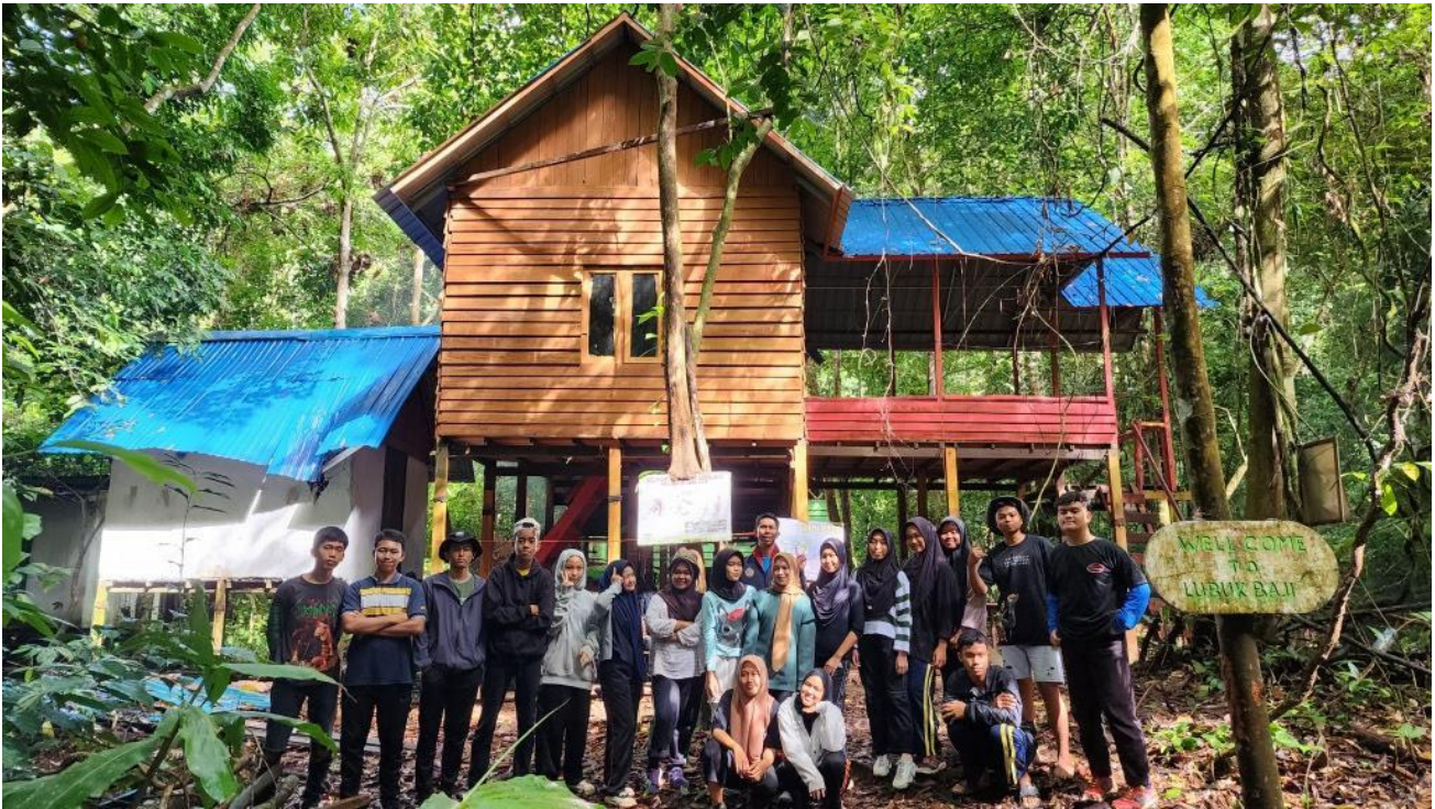
The field trip participants in front of Lubuk Baji camp.