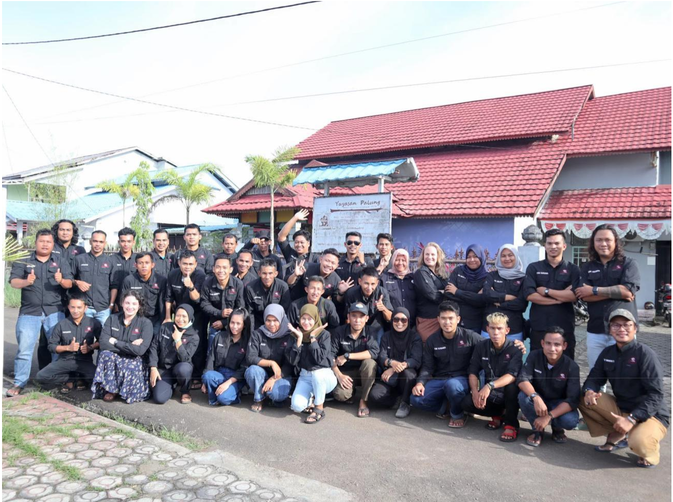
Keluarga Besar (big family) - the team at the 2023 GPOCP/YP Annual Meeting

I am incredibly grateful for the experiences – both personal and professional – I have gained throughout my work with the orangutans (and people) of Gunung Palung National Park. These experiences have enriched me with skills that I know will help me to succeed in my future as I pursue my PhD, and beyond. GPOCP/YP has helped fortify me with a wide range of skills and allowed me to develop a cultural and linguistic competency to collaborate with people of different ages, nationalities, and backgrounds. I am excited and humbled to see where this next stage of my career takes me.