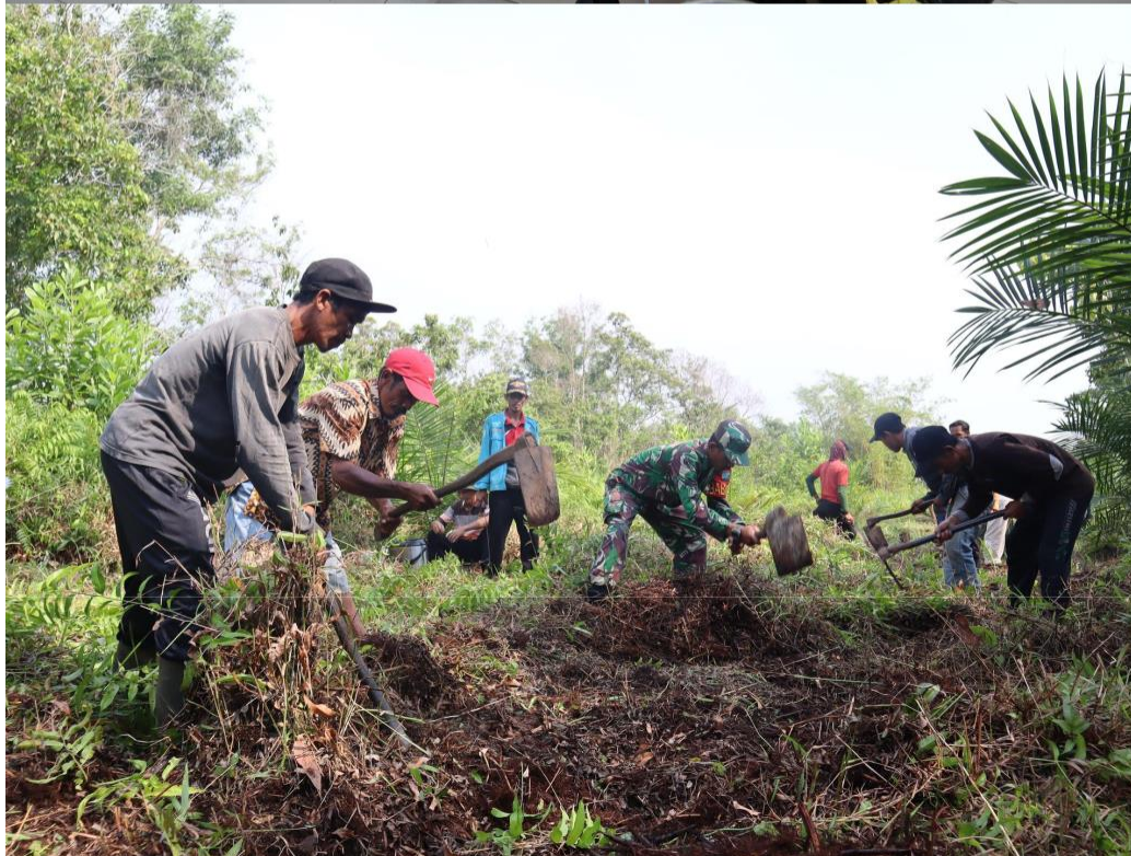
Top: Demonstrating how to make solutions to alter soil pH and fertilize the soil. Bottom: Practicing manual land-clearing techniques that do not involve burning.