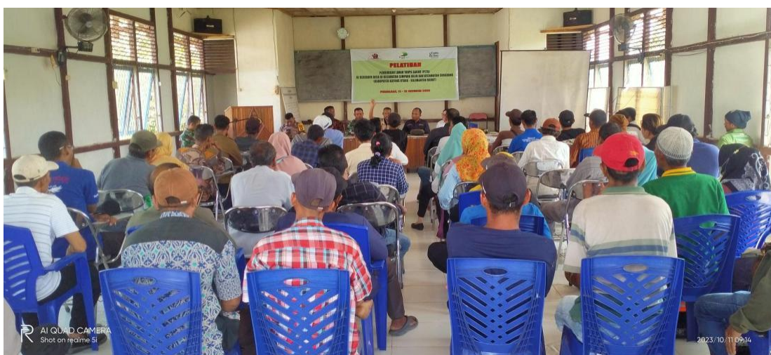
A full house, listening to the panel discuss the importance of fire prevention.

From the end of August 2023 – September 2023 fires occurred in both Ketapang Regency and North Kayong Regency, including several areas around Village Forests in Simpang Hilir District (Padu Banjar Village, Pemangkat Village and Nipah Kuning Village). The fire started when several villagers set fires to clear agricultural land and plantations, which resulted in the fire spreading and becoming uncontrolled. The Village Forest Management Boards had to work hard together with partner institutions (KPH Kayong, Manggal Agni, Fire Care Community) to extinguish the fire so that it did not spread to the Village Forest area.