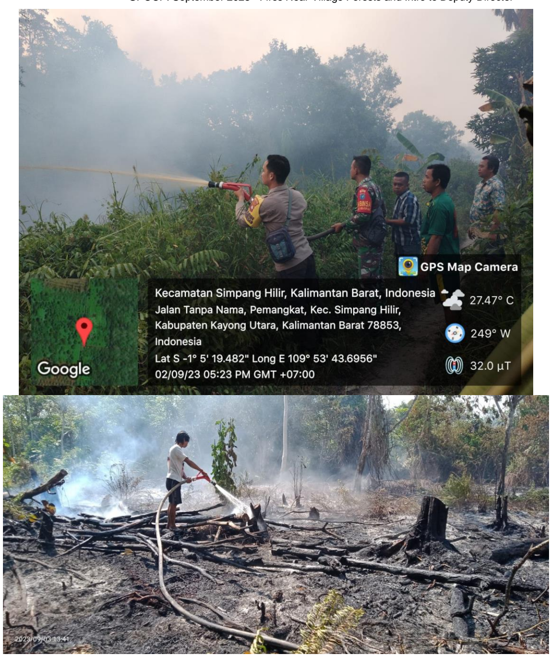
Fire fighting in the villages of Pemangkat (top) and Nipah Kuning (bottom).

In their efforts to extinguish forest and land fires around this village forest area the LPHD collaborates with the Indonesian National Army, Police, Forest Management Unit, Kayong, Manggala Agni, Regional Disaster Management Agency, village government, Fire Care Society (MPA) and various other parties. Yayasan Palung's role in these efforts to extinguish forest and land fires is providing support for LPHD operational needs in the field.