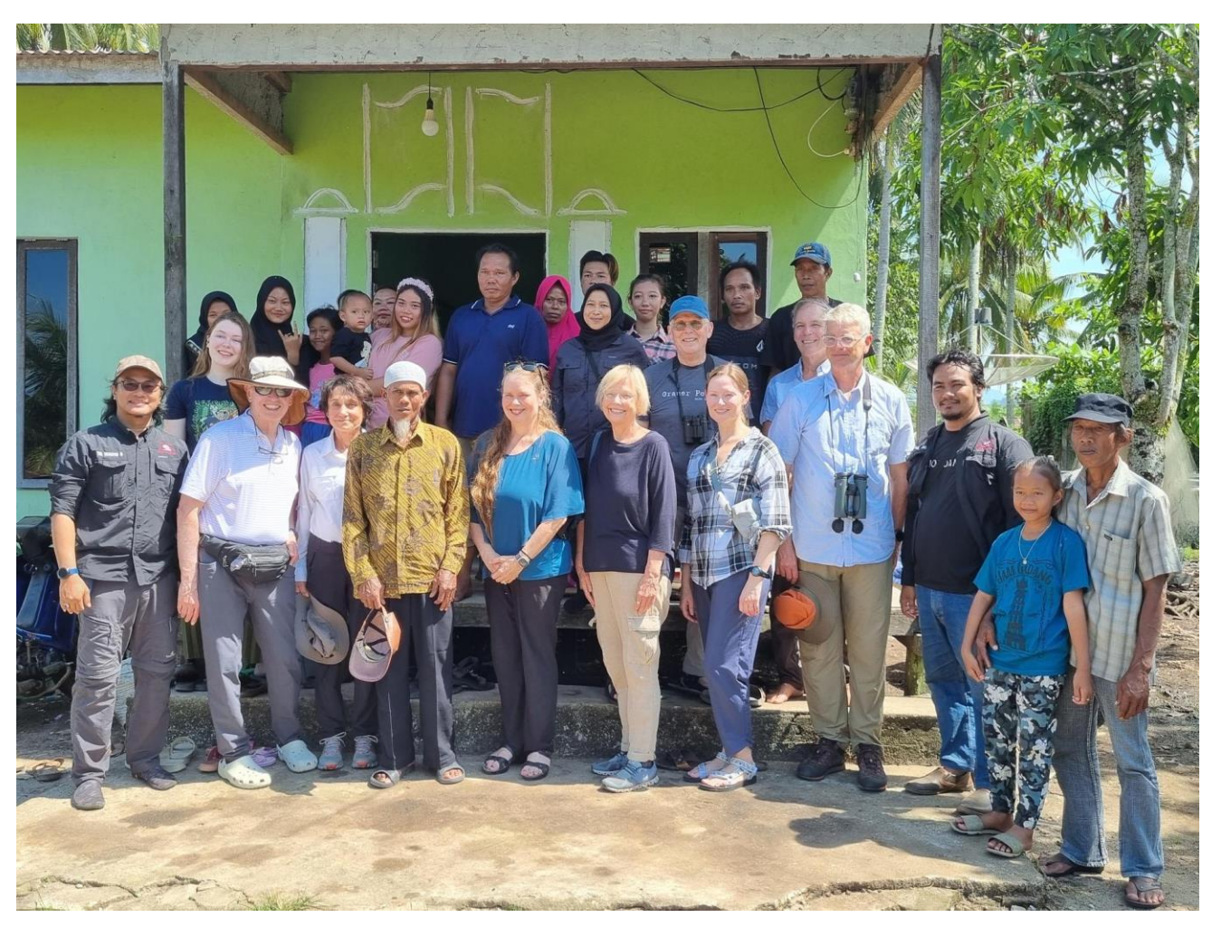
I went with members of our leadership and conservation teams to visit with participants of our Sustainable Livelihoods program, along with our guests from the Leakey Foundation visit this summer 2023.