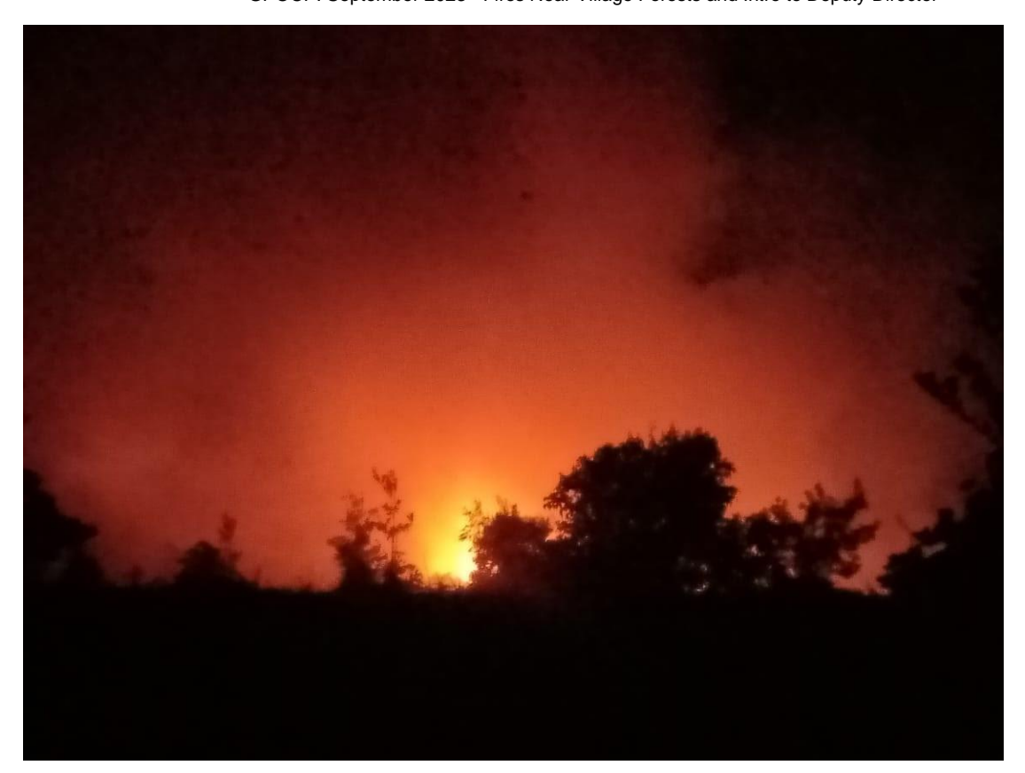
Fire burns at night near one of the Hutan Desa (village forest) areas that we work with in the village of Padu Banjar.

During this exceptionally dry period, the village forest areas that are supported by Yayasan Palung were threatened by fire. The source of the fire came from land that was controlled by the community and the fire spread and started approaching the village forest area. Based on monitoring carried out by Yayasan Palung, there were several active fires in village forest areas, including Padu Banjar Village, Pemangkat Village, and Nipah Kuning Village. The fire in Padu Banjar Village was ± 300 meters from the Village Forest, in Nipah Kuning Village ± 500 meters. Near Padu Banjar, a total of two hectares were burned. These fires resulted in losses for the community, especially people whose land already had plants, both perennials (Palm, Rubber, Jengkol, Petai and so on) as well as horticultural plants, especially pineapple which is a favorite plant on peatlands.