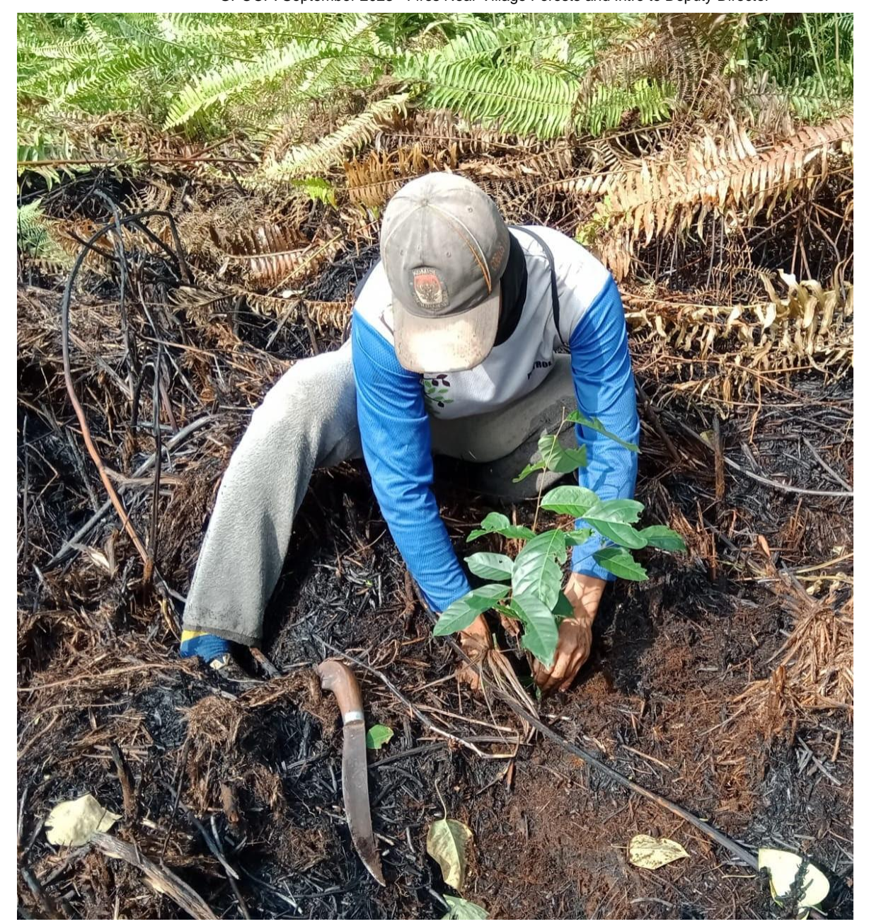
Forest rehabilitation began as soon as the fires were extinguished in the village of Padu Banjar.