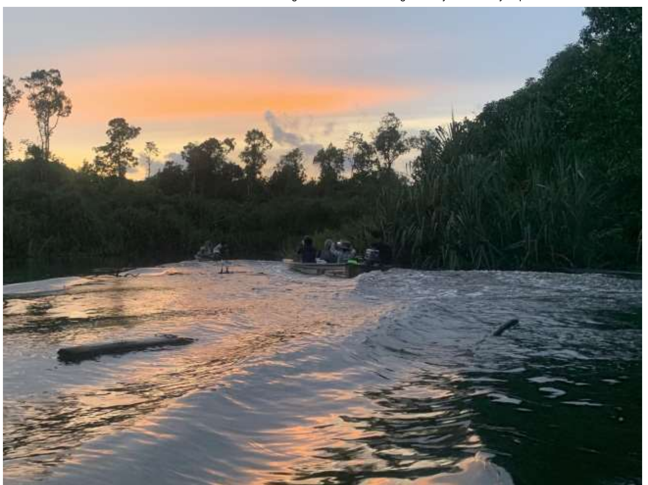
A final group photo of all guests, staff and researchers (top) and the trip downriver from Cabang Panti Research Station.

It was truly a thrill to be able to share such special adventures with this remarkable group of travelers! After thirty years of research and many Leakey Foundation grants it felt like the least that we could do to thank them for their support of the project. Cabang Panti is a difficult place to reach, and hats off to the Leakey Foundation members and friends for being willing to put up with some discomforts to have what I hope was a truly remarkable adventure at a remote research enclave in the middle of Gunung Palung National Park. Your visit will be remembered for years to come! And a special thank you to the leadership of the Gunung Palung National Park Office for making this possible.