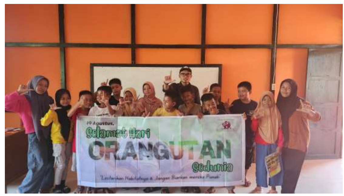
Our Environmental Education team celebrates World Orangutans Day in one of our Hutan Desa villages, Desa Penjalaan.