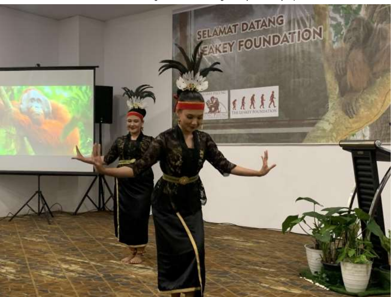
Dancers from our youth conservation group performed traditional Melayu (top) and Dayak (bottom) dances at the welcome banquet.

Sunday we left bright and early to head to the Sukadana region, our jumping off point for visiting the National Park and the center of our sustainable livelihood and conservation outreach and education activities. Members of the Tanjung Gunung Fish Farming Cooperative were thrilled to welcome us to see their fish ponds in operation and to learn how these are providing sustainable alternative income to ten families. We discussed the steps involved that have made this a productive enterprise and how the model has been replicated in several other villages.