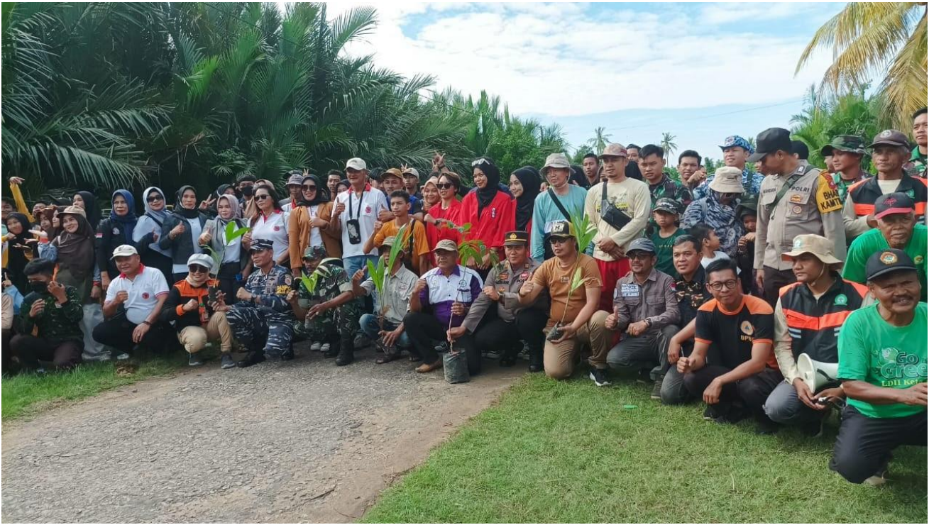
Participants join together at the event in honor of World Environment Day and World Rainforest Day.

We also asked all participants who attended to bring drinks from their respective homes using bottles that were not made of plastic. We aimed to reduce plastic waste at the event, particularly because this year's theme for World Environment Day was "Beat Plastic Pollution." After all the tree planting was complete, we all socialized and relaxed together at the Celinging Beach, enjoying the scenic views and cool air of the mangrove forest.