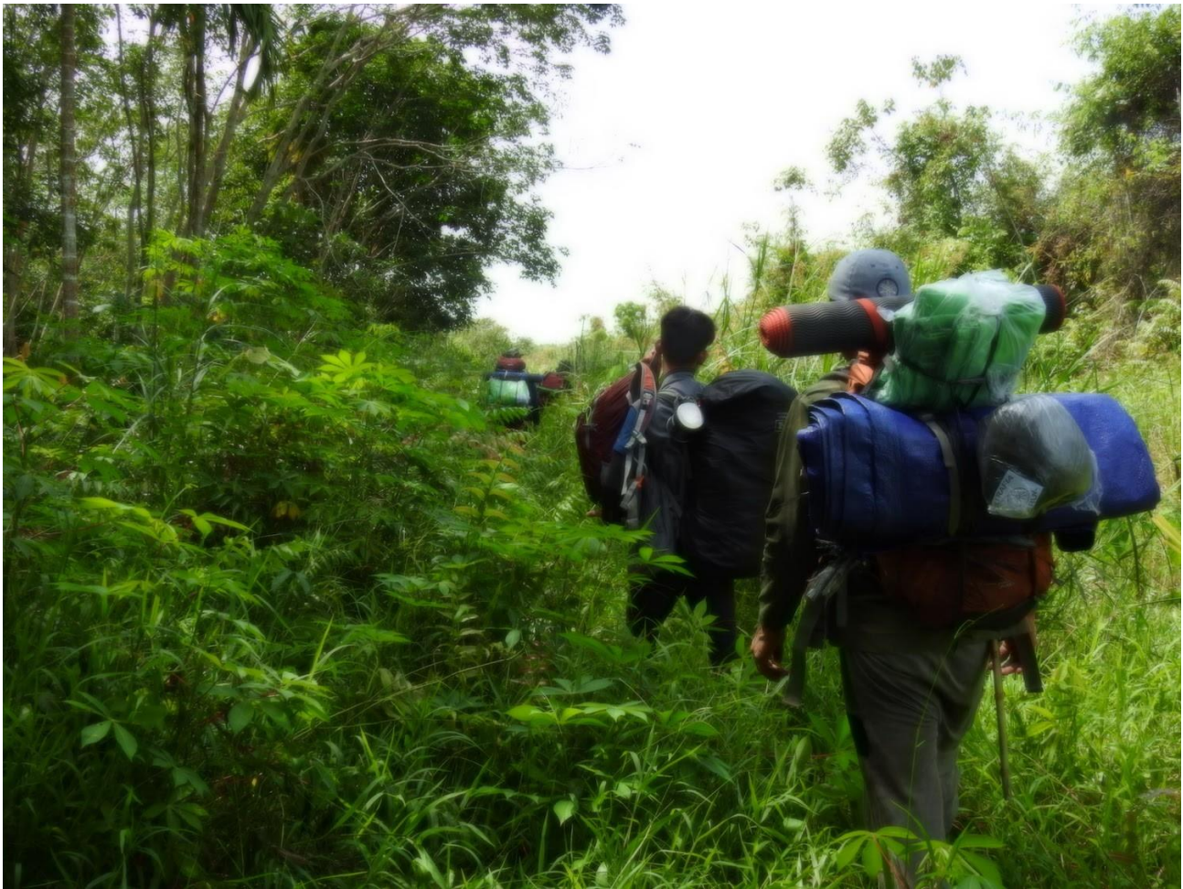
The survey team trek into the Village Forest of Padu Banjar.