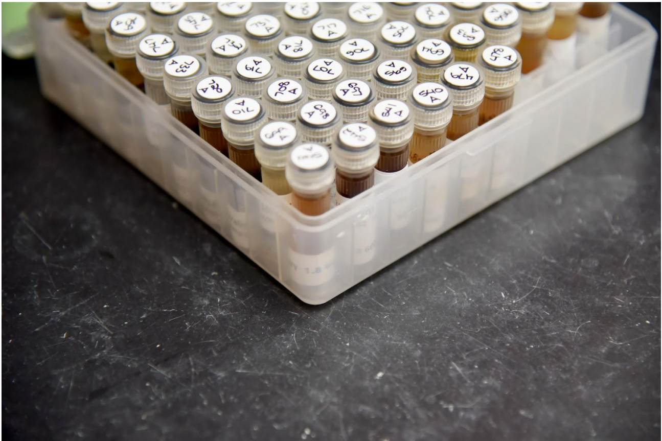
Orangutan urine samples that survived the journey from West Borneo to Jakarta to Boston to Virginia.

Urine from humans and other mammals contain water, salts, and urea along with hormones and other biomarkers that are excreted from the bloodstream. Urine provides a wealth of information related to an animal's overall health, reproductive state, and metabolic functions. In this sense, urine from any wild animal is like liquid gold to researchers! To measure hormones and biomarkers in urine, we run tests called immunoassays. Enzyme immunoassays utilize the mechanisms of our body's antibodies, which bind to foreign substances, such as bacteria and viruses. During an enzyme immunoassay, reagents are added that will eventually result in a color change depending on the concentration of antibodies bound to the hormone/biomarker of interest. For the tests that primatologists typically run, the color change is from blue to yellow.