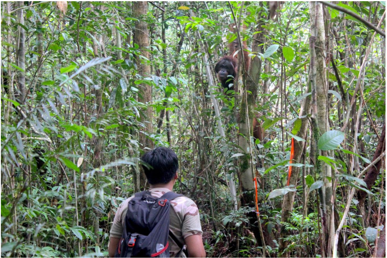
Sabta follows an orangutan named "Logan" at Cabang Panti Research Station. Sabta makes sure to maintain a distance of at least 15 meters from the orangutan at all times, as to ensure all data collection is safe and completely non-invasive.

Later, on February 17 th , four more trail cutters and a substitute cook came to camp. After another eight days of work, we were able to complete about 80% of the new trail system! I hope that soon this area is just like Cabang Panti. Now, thanks to the new transects, as of March 17 th , we have been able to follow orangutans a total of 45 times! As a community, we will protect the camp and the surrounding forest, and many people can gain economic benefit from working to help carry logistics to the camp on a rotating system. I am excited to be working in this new role, and can't wait to see how the new camp and research continue to grow over time.