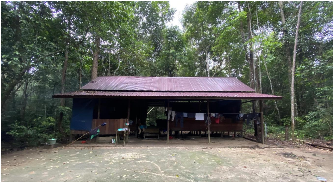
The new Rangkong camp, which now houses GPOCP/YP staff full time.

On February 2 nd , Field Assistants Sahril and Dang searched for orangutans along the new transects, using the same method we use at Cabang Panti Research Station. From February 2 nd -4 th , I went back to Cabang Panti for some training on data collection and management.