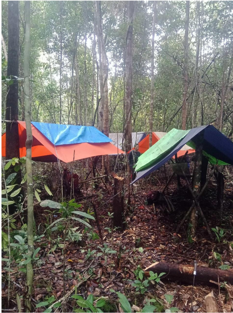
The tarp camp set up by the Nipah Kuning SMART team during a recent patrol.