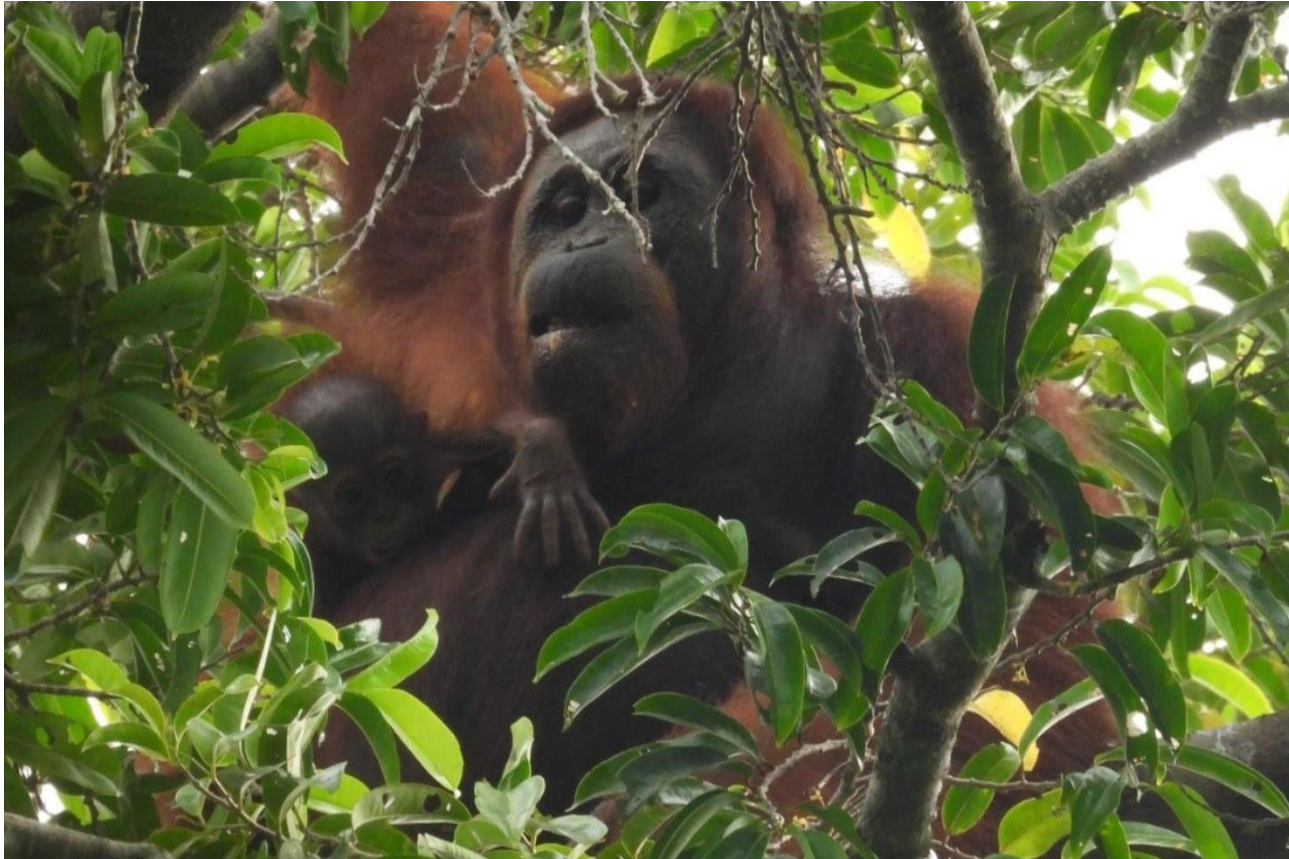
Adult female orangutan "Tari" and her infant during a recent follow.

I continued going on follows after that first week. Each day we depart from camp at 4:00AM to walk through the forest trails to the orangutan sleeping nest location and wait for the orangutan to wake up. Data collection is carried out throughout the day until the orangutan builds a sleeping nest. The behaviors of the orangutan recorded include resting, eating, socializing and traveling, with observation intervals every 5 minutes, or when the primary activity changes, until the orangutan falls asleep in their nest. Normally we continue for 5 days of observation.