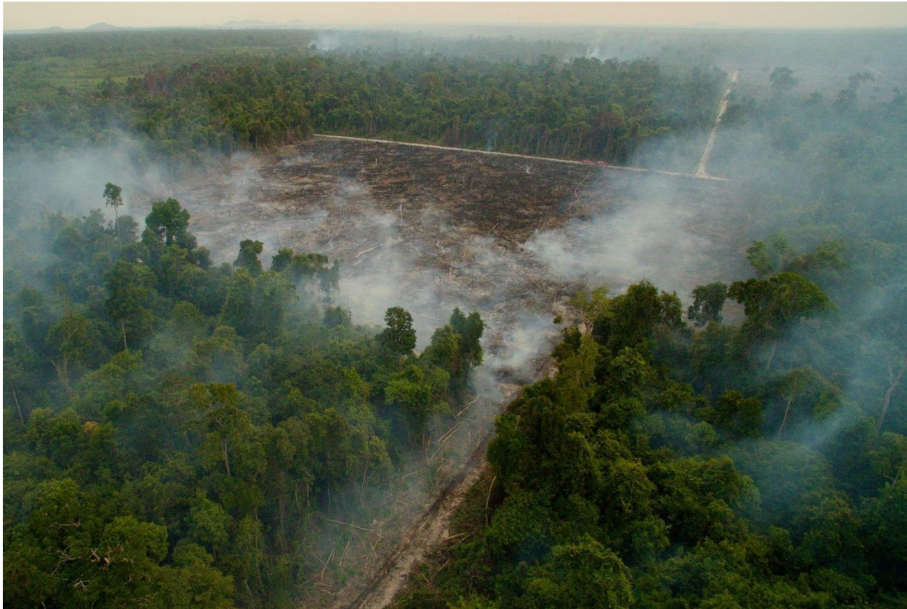
A freshly cleared patch of forest for agricultural use in the Gunung Palung National Park buffer zone.

In 2019, Yayasan Palung provided one set of firefighting equipment, which was placed in the Nipah Kuning Hutan Desa . This past month, we provided an additional five units of equipment. Four of these sets were given to the Hutan Desa in Padu Banjar Village, Pulau Kumbang Village, Pemangkat Village, and Penjalaan Village. The fifth set was given to the village of Tanjung Gunung, which directly borders the National Park, and is the entry point for researchers to hike to Cabang Panti Research Station.