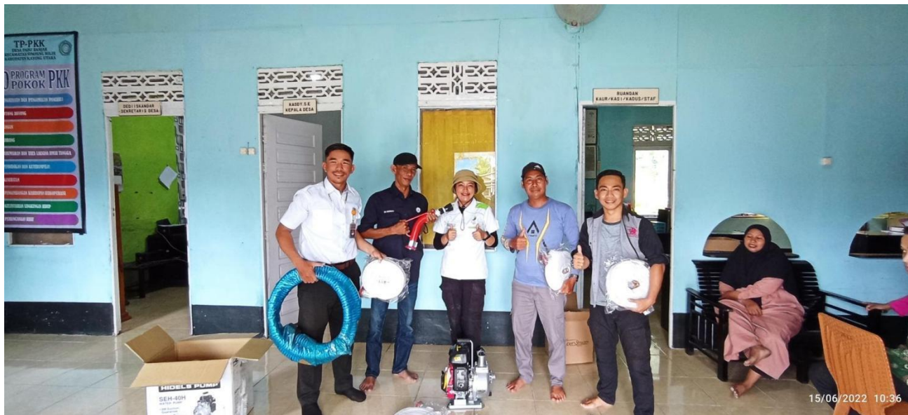
The delivery of equipment to Pemangkat (top) and Padu Banjar (bottom) villages.