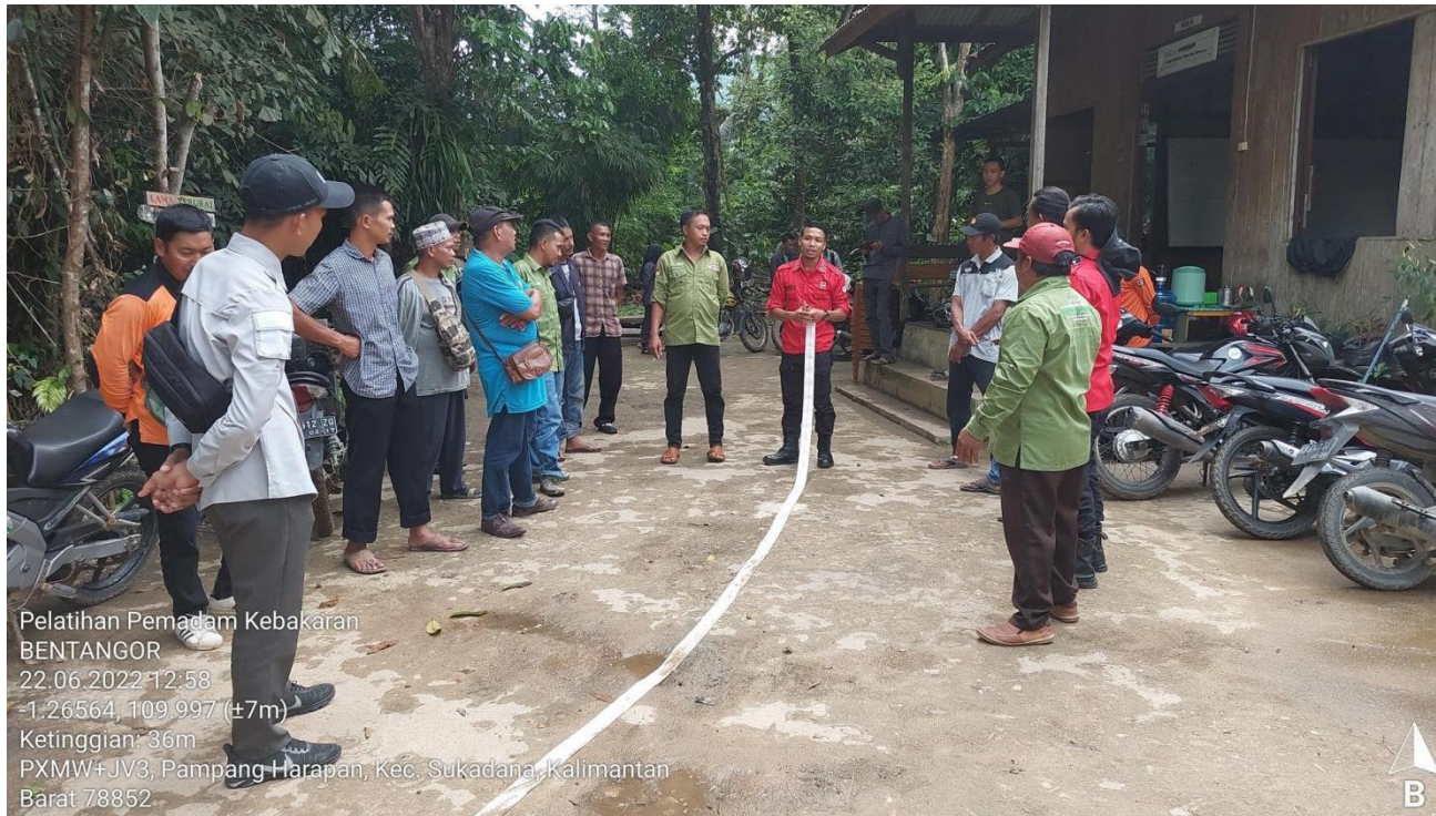
LPHD and Tanjung Gunung community members receive training on how to use their new equipment to effectively fight fires.

As we approach the dry season, we would like to raise funds to buy two additional sets of firefighting equipment to give to two Hutan Desa in Rantau Panjang and Batu Barat villages. Please consider making a charitable donation to help support this initiative.