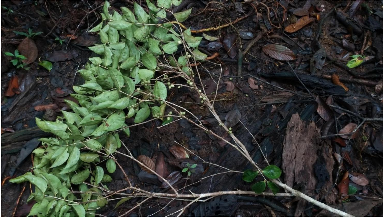
An orangutan food item (Ptenandra coerulesceus) that fell from a tree.

The collection of these foods is essential to my research project. The goal of my senior thesis is to look at the secondary metabolites in orangutan foods to determine the medicinal potential of plants foods. Hopefully, this research can provide information in the future about orangutan foods that can be used as a source of natural medicinal plants for animals and humans.