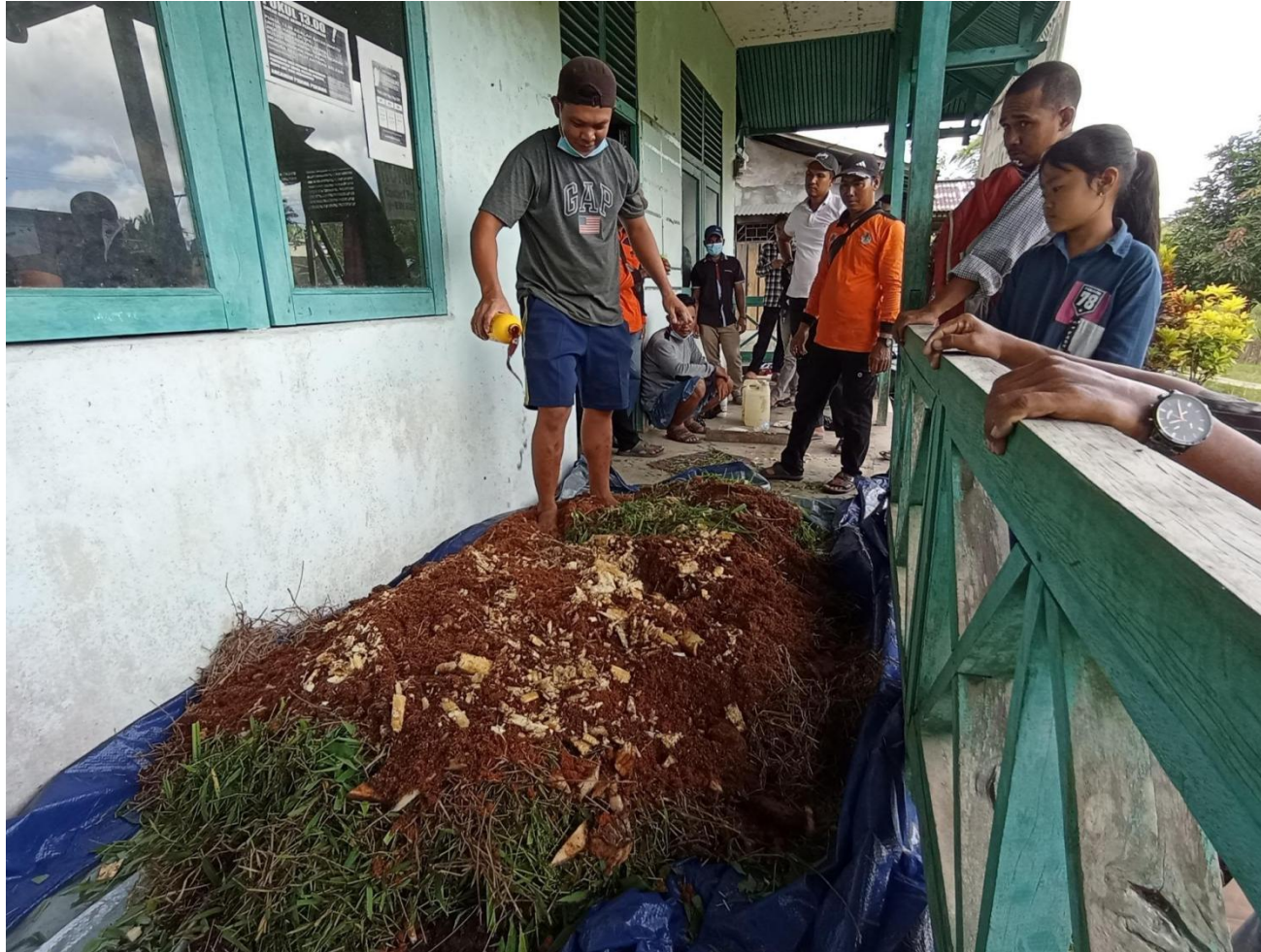
Members of Padu Banjar and Pulau Kumbang villages learn to compost readily sourced materials to create organic fertilizer.

Kumbang villages. In addition to saving farmers the expense of purchasing fertilizer, the use of homemade organic fertilizer can also benefit human and environmental health. The raw materials used to make organic fertilizer consists of dry and wet grass, cow dung, husks, banana peels and more.