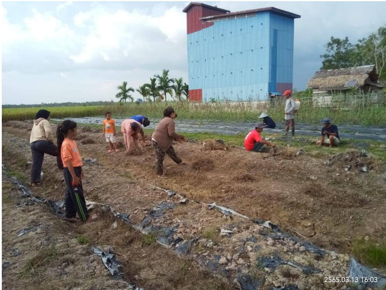
Villagers from Padu Banjar clear land to prepare farming plots where seedlings were later planted.