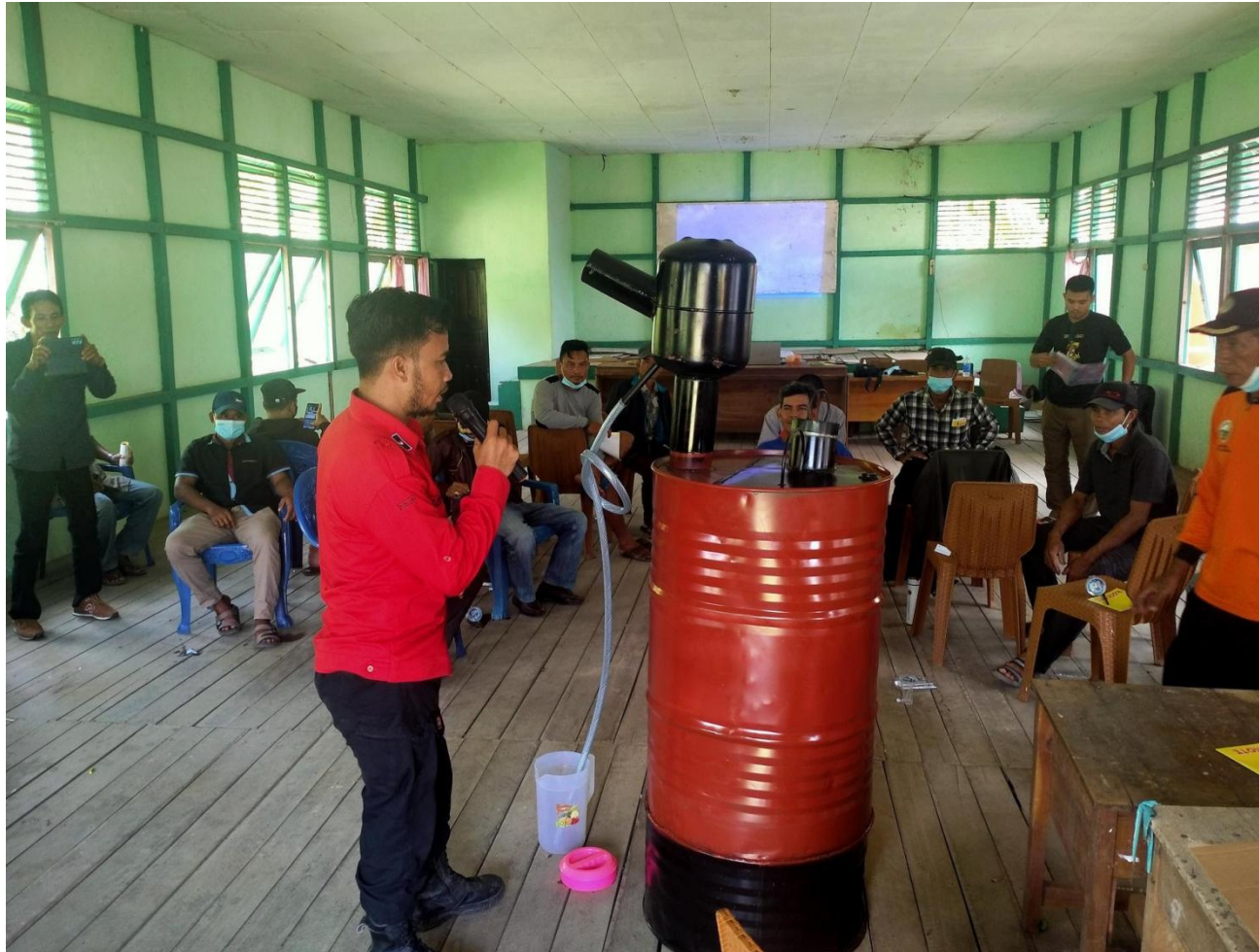
A workshop facilitator from Manggala Agni demonstrates how to use this barrel and condenser to produce liquid smoke.

The people of Padu Banjar and Pulau Kumbang have many rubber tree plantations, and liquid smoke can also be used as a rubber sap freeze. This is because liquid smoke contains cellulose, hemicellulose and lignin, and can lower the pH of rubber latex, stopping the sap flow by making it clot more quickly. The production of liquid smoke is also environmentally friendly and inexpensive. Additionally, liquid smoke is commonly used as a preservative for fish, meat and tofu. If liquid smoke is used to preserve these foods, it better maintains the levels of protein and fat when compared to other preservatives. Liquid smoke is also used to produce many cosmetics, disinfectants, pest repellents and soil fertilizers.