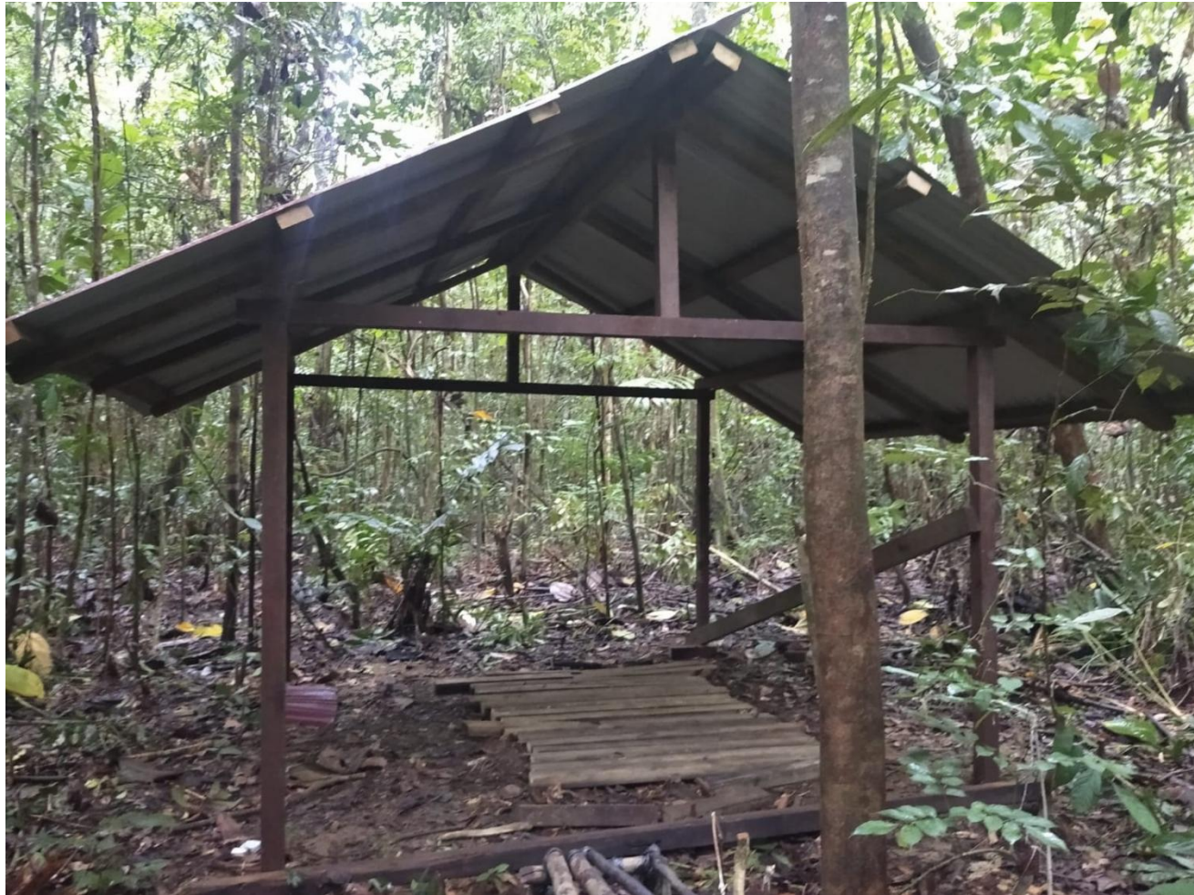
A small roofed structure will eventually house a generator to provide electricity at the camp.