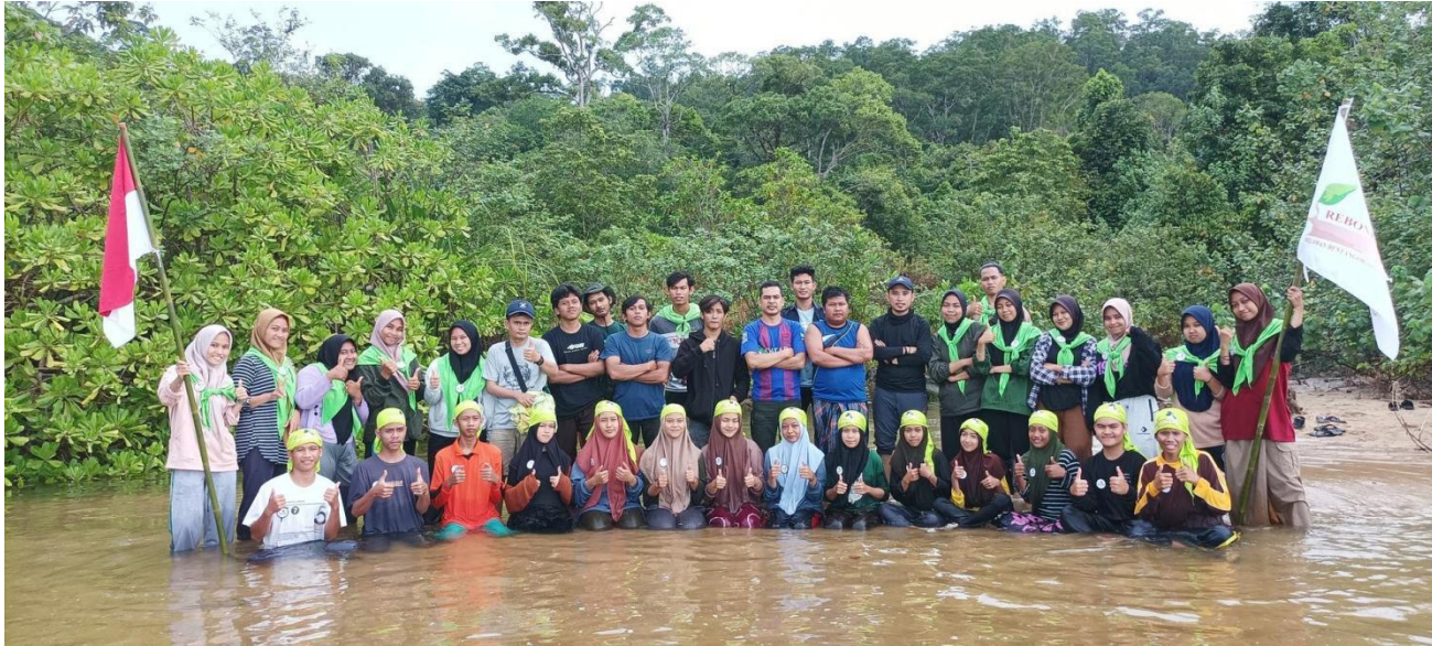
New REBONK members (front row) pose on the Mak Bagok beach with current members and GPOCP/Yayasan Palung staff (second row).

In 2022, 14 new members joined the 11 th cohort of REBONK volunteers. These new volunteers come from many different schools throughout the Kayong Utara Regency. This month, from February 11th-13th, an inauguration was held at the Mak Bagok beach, in Pampang Harapan Village, in the Sukadana District. During the inauguration event, new volunteers participated in a variety of activities including learning about the environment, observing wildlife, and listening to the sounds of nature. Volunteers were also invited to discuss environmental issues such as waste, large-scale land clearing and flooding. The goal of this activity was then for volunteers to map out these environmental problems and discuss potential solutions.