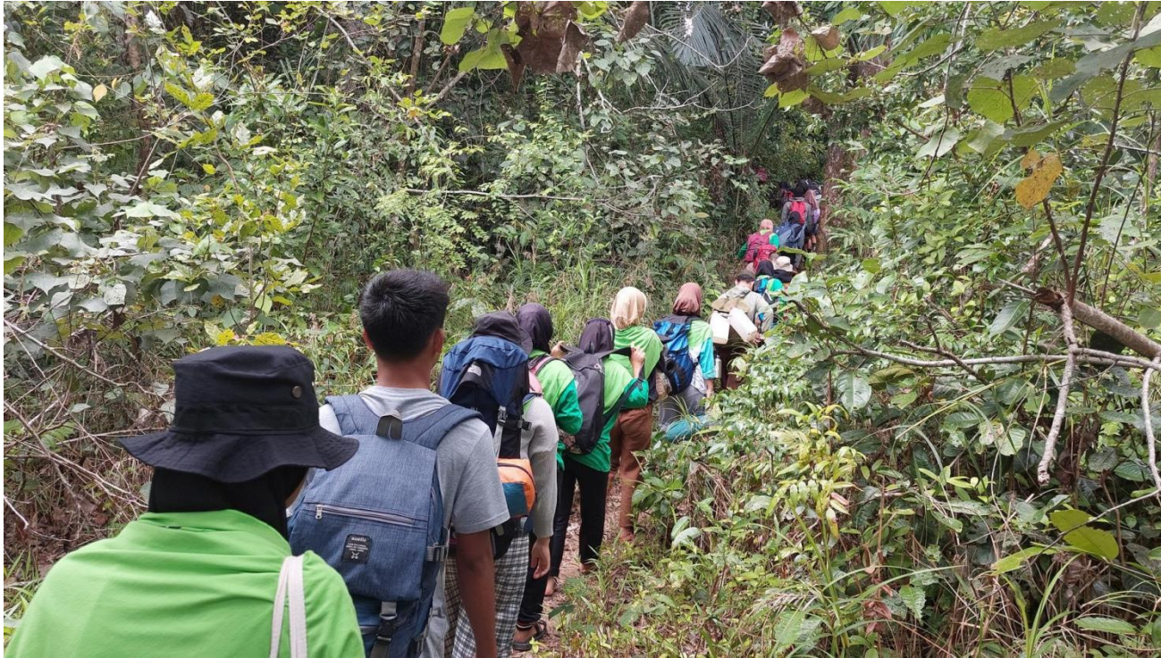
REBONK volunteers hike through the forest to get to the Mak Bagok beach.