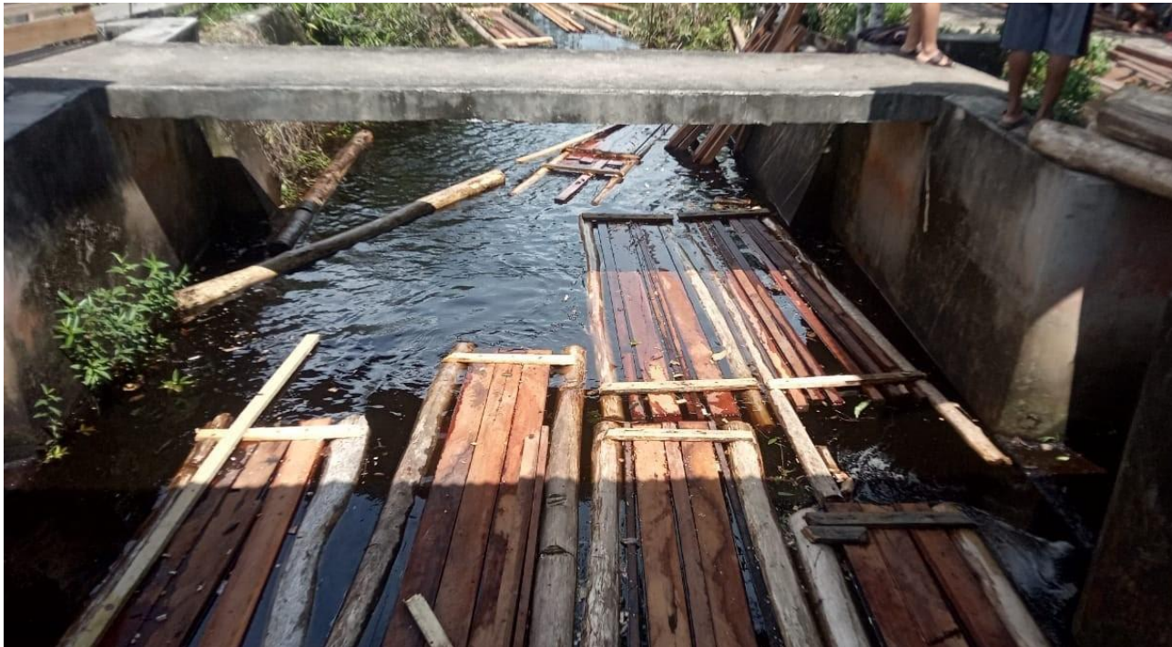
Wooden planks float upriver, from the dam at the edge of Tanjung Gunung to the Rangkong site.

Next, we needed to transport all the materials from Tanjung Gunung to the Rangkong River camp location, which is about 7 kilometers. Village members helped to float wood upriver and carry other materials over the course of two days. After all the materials arrived to the location, we could finally start the building process. We hired craftsmen from Tanjung Gunung to build the camp.