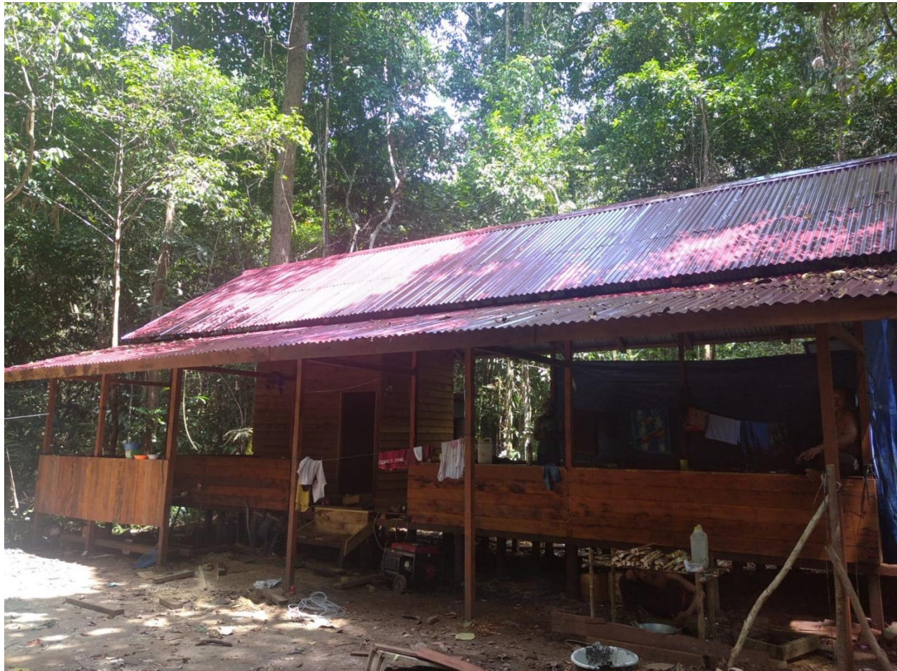
The new "Camp Mangifera" at the Rangkong Research site.

On February 17th, less than two months from the start of construction, all the work was completed! We are very satisfied with the results of the construction of the new camp. Now we are even more excited to continue developing new research as this site. We are also confident that foreign researcher will be very happy with the camp and excited to conduct research here.