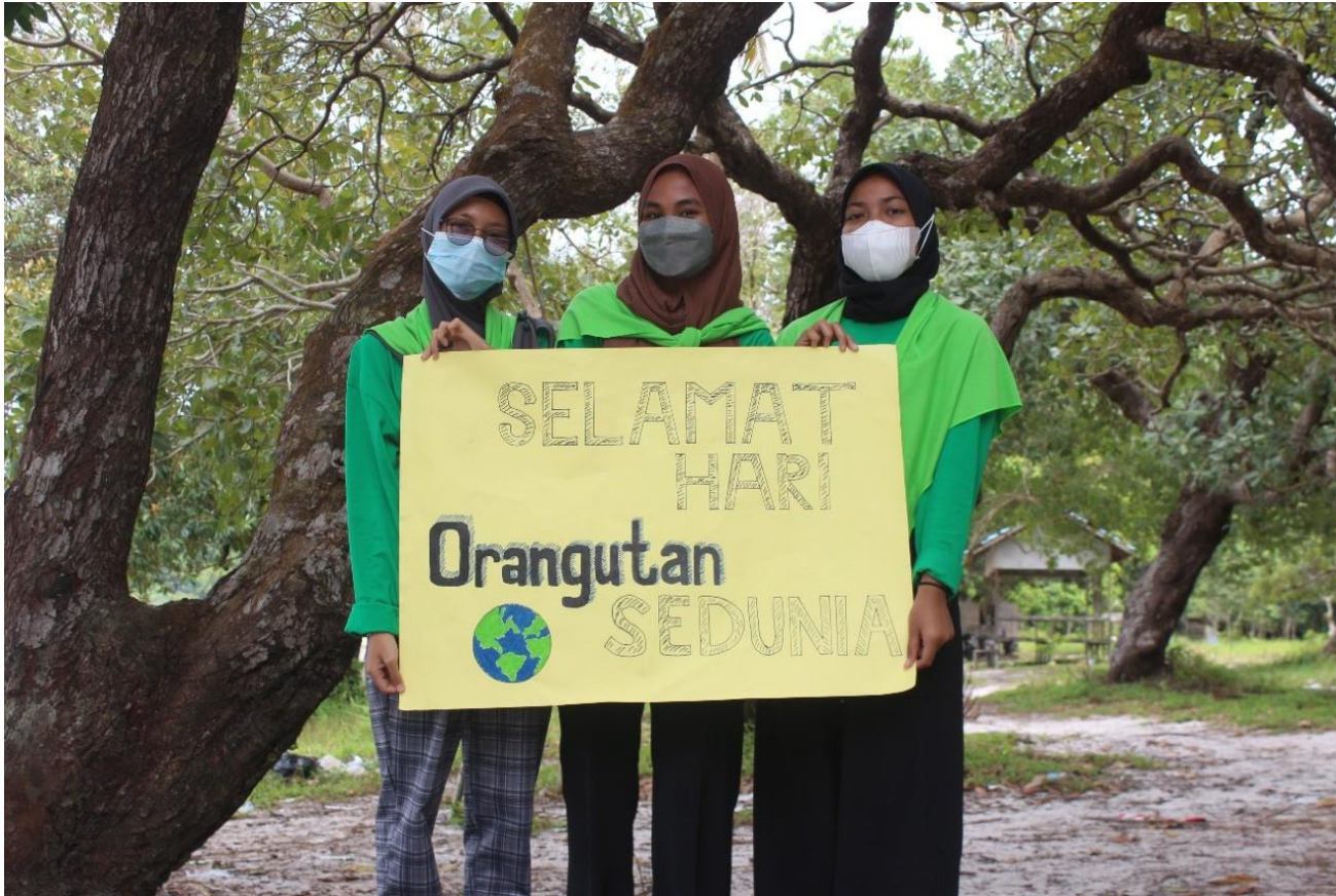
Members of the REBONK volunteer youth group hold handmade signs at the Pasir Mayang Beach. Signs include phrases like "save the forest for the future", "this is my action, where is yours", "stop cutting down our forest" and "humans need the forest, the forest needs orangutans".