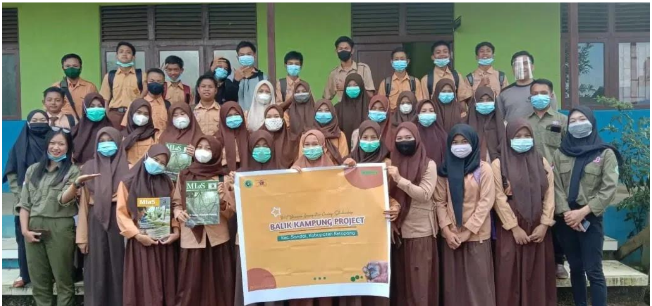
Junior high school students in Sandai attended lectures about forests and conservation.