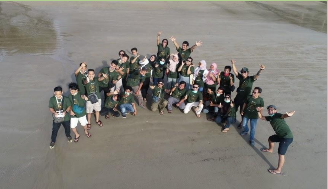
GPOCP conservation and research staff pose for one last drone photo on the beach.