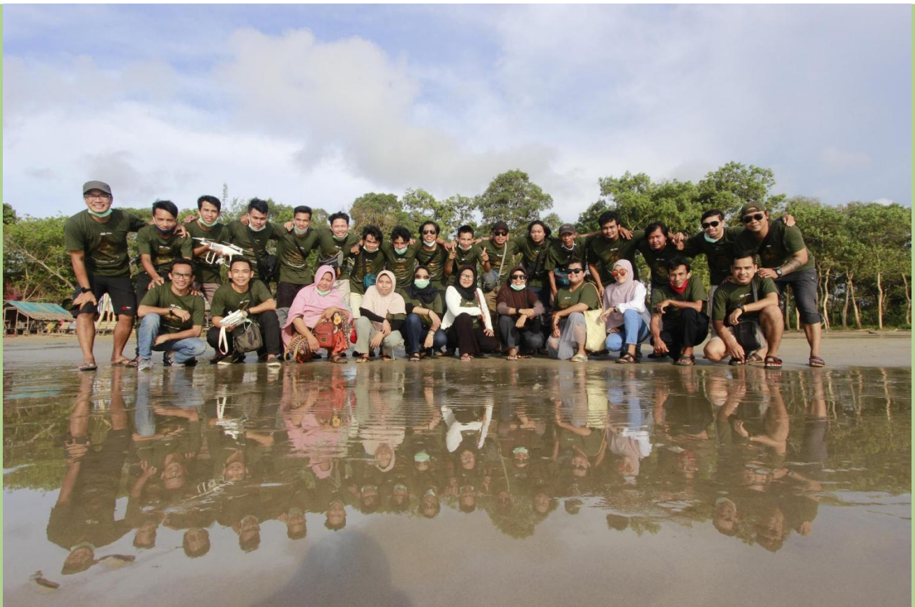
GPOCP conservation and research staff pose together on the beach at Pasir Putih.

Next, after evaluations, managers from each program (Environmental Education and Conservation Awareness, Sustainable Livelihoods, Wildlife Crime and Investigations, Customary Forests, and Research) shared their plans for 2021.