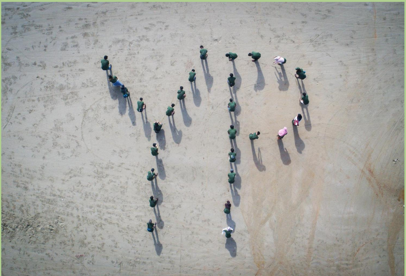
Staff pose to spell out "YP", short for Yayasan Palung, GPOCP's Indonesian name.

I consider this Annual Meeting to have been a great success, as we were able to create plans with measurable impact, and will output activities based on our shared goal of conserving orangutans and their habitat. Through this meeting, we also continue to build a strong connection between all the GPOCP staff from the different programs. This connection is essential for us to achieve both our vision and mission.