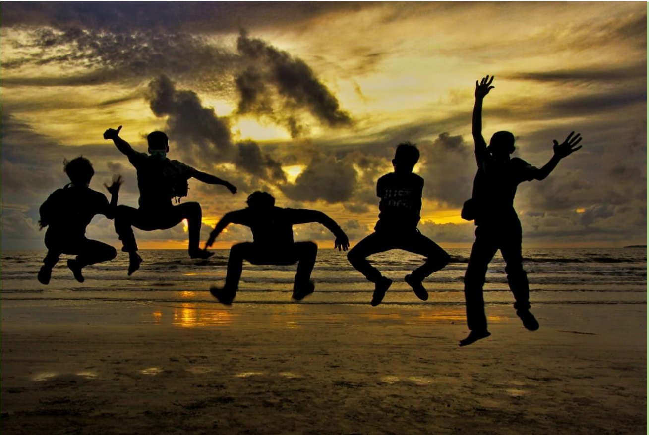
GPOCP staff enjoy a beautiful sunset on Pasir Putih Beach.