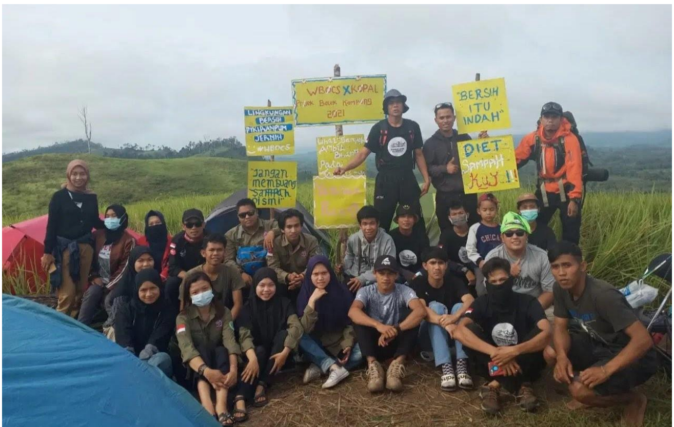
Participants from the Sungai Laur camping expedition pose with handmade signs about proper waste management.