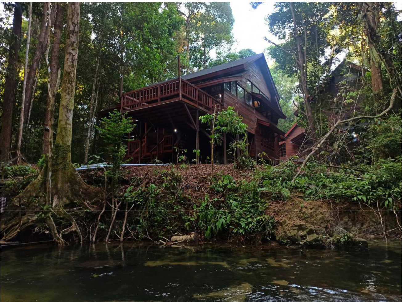
The newly rebuilt Main Camp which houses the laboratory, specimen room and research library.

The Cabang Panti Research Station, in Gunung Palung National Park, is home to our long-term orangutan research project. Recognized by the United Nations Great Ape Survival Project as a conservation priority area, GPNP and the surrounding forests are one of the most important blocks of orangutan habitat and one of the only remaining tracts of lowland Dipterocarp rainforest in Borneo. The area has a very high biodiversity conservation value, providing critical habitat for many endangered species, including orangutans, proboscis monkeys, gibbons, hornbills and sun bears. It also provides clean water to surrounding regions and is a buffer against climate change, with deep peat forest acting as a carbon sink and mitigating flooding and damage to coast farmlands from tidal salinity. The Park's proximity to the Java Sea and its small, isolated mountain range, creates 8 distinct ecological zones. This biodiversity of animals and plants has attracted both national and international researchers to conduct studies in the GPNP area.