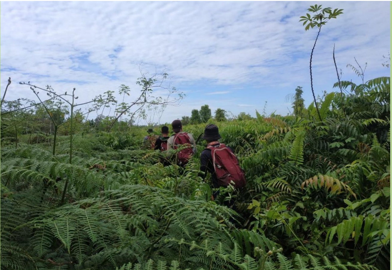
GPOCP field surveyors and members of the Customary Forest Management Boards enter the forest edge on their way to conduct biodiversity surveys.

In September, the first environmental education and mobile health clinic event was held in Pengkalan Teluk Village, in collaboration with another local NGO, Alam Sehat Lestari (ASRI). Our team also wrapped up a survey at our Bentangor Environmental Education Center , assessing tree types and carbon content within the surrounding area. Schools in the Kayong Utara Regency opened back up in October, allowing some limited Environmental Education programming to resume.