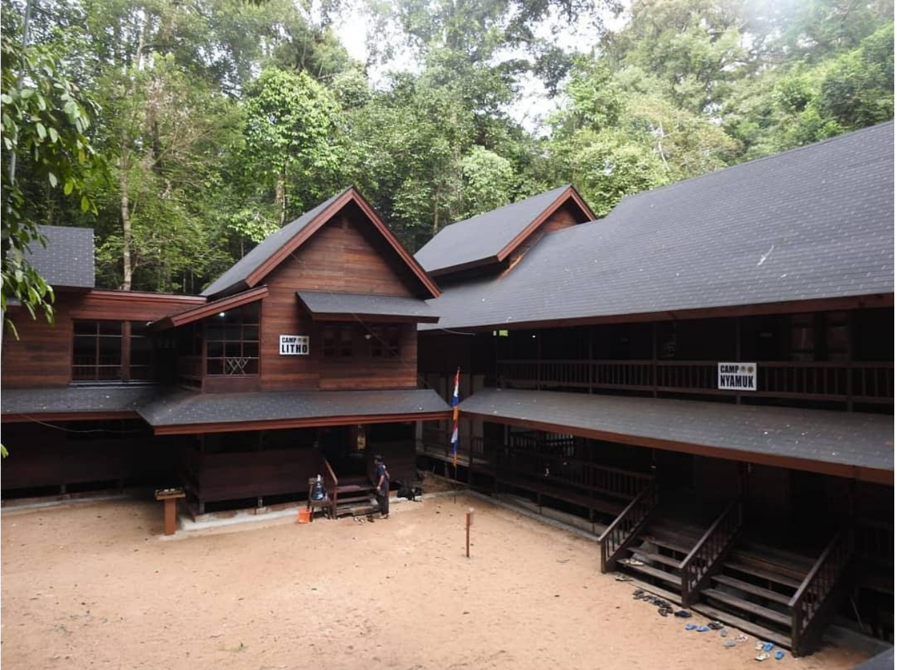
The new Camp Litho (left) which houses National Park Staff and a large meeting room, and Camp Nyamuk (right) which has research assistant lodging as well as a kitchen, dining area, and prayer room.

Panti has had a positive economic impact on the surrounding community, as many members of local villages have been employed by the long-term research projects.