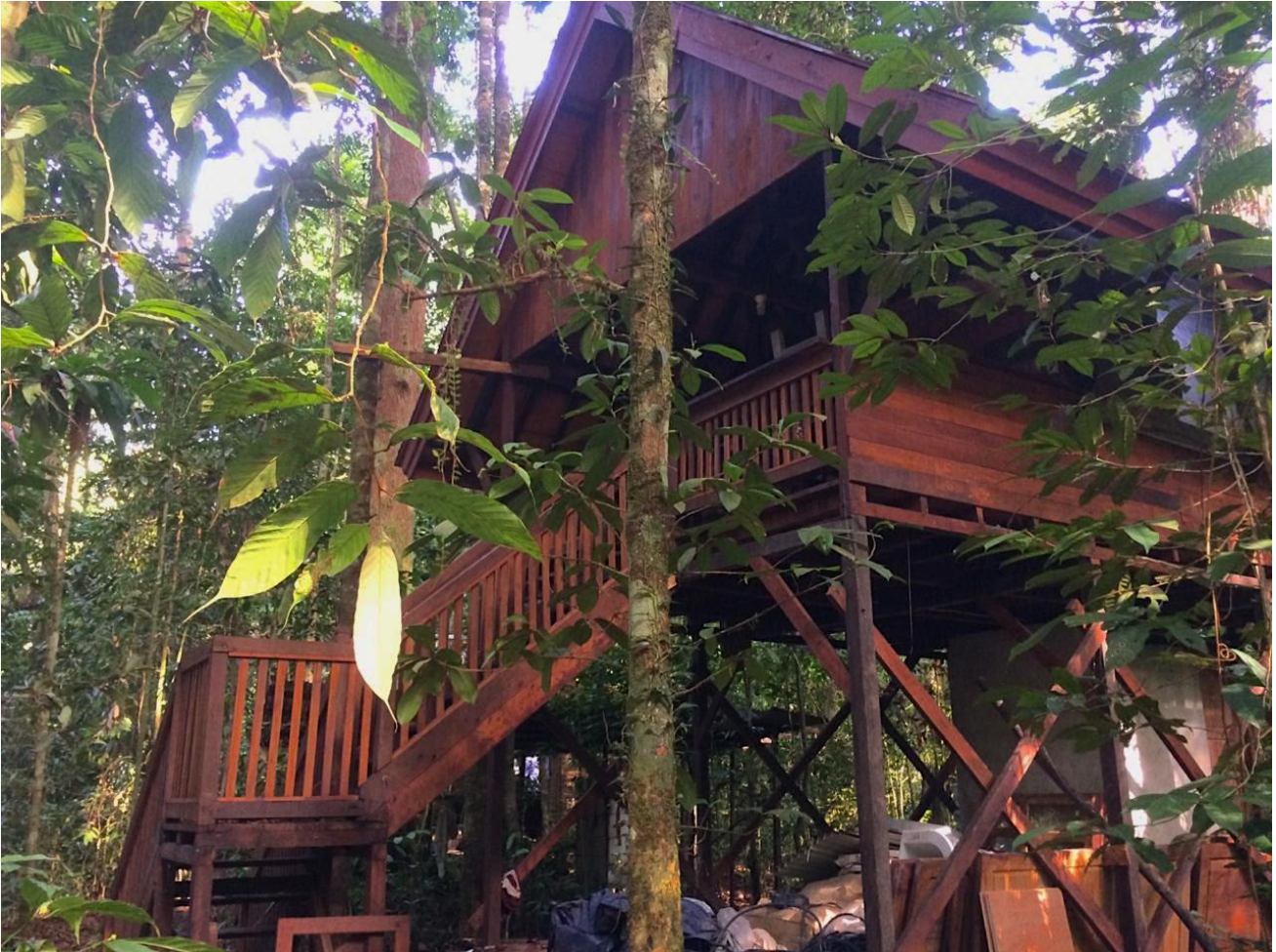
One of 6 new researcher houses which sit along the Air Putih River and AP trail. Each stilted house has an elevated sleeping area, with a private toilet and bathing room downstairs.

Since the station is located deep in the primary rainforest, over 12 kilometers from the nearest village, buildings can quickly deteriorate, due to wood rot, termites, fallen trees and flooding. Thus, after more than a decade since the last major rebuilding, many of the camp structures were in need of some reconstruction. In 2019, GPNP Research Station Head, Endro Setiawan, with support from GPOCP Research Director, Wahyu Susanto, submitted a competitive proposal to the Indonesian Ministry of Forestry to have the station rebuilt. Excitingly, their proposal succeeded, and it was decided that Cabang Panti would become the new model research station for all of Indonesia!