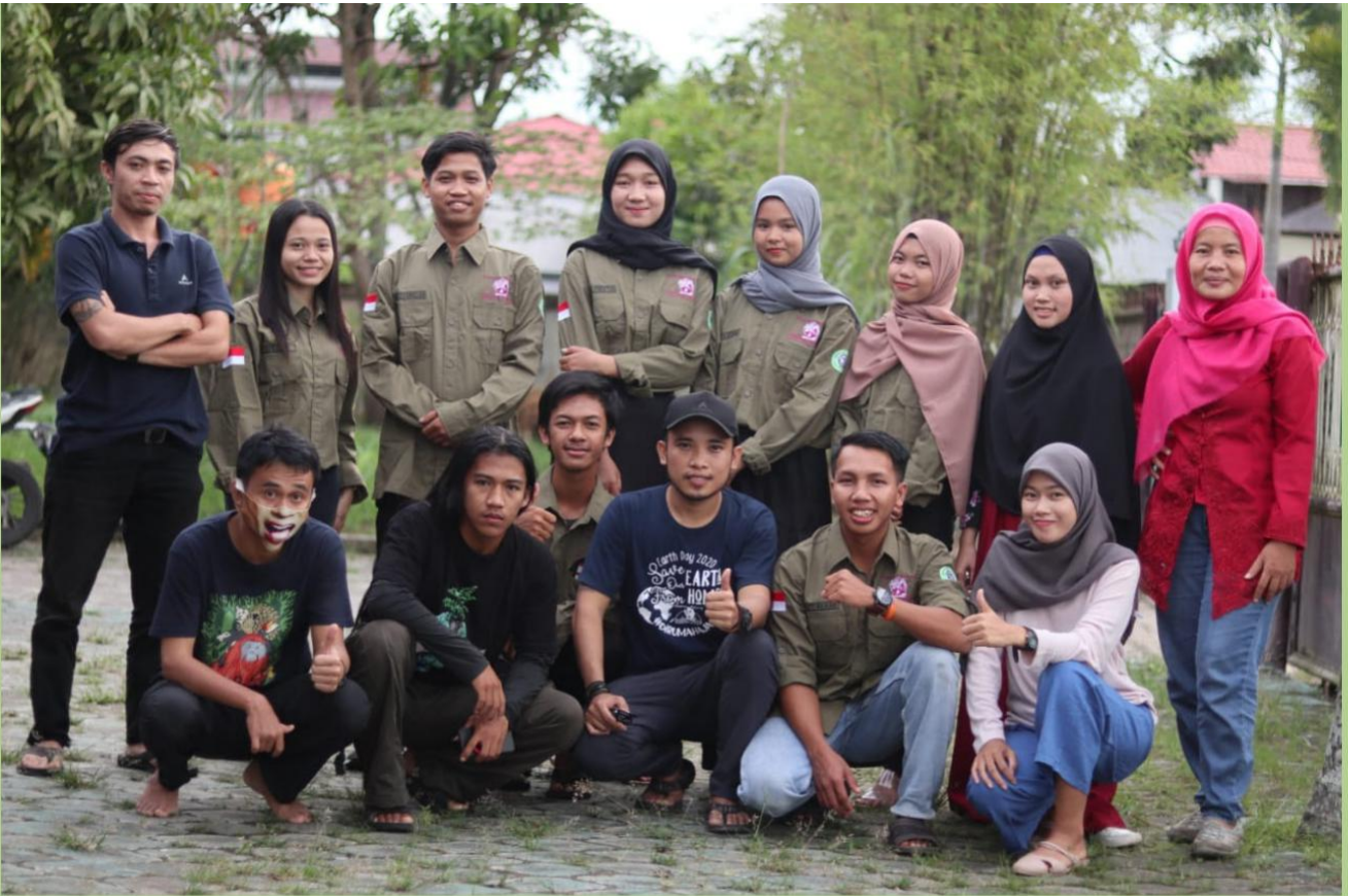
The six new university scholarship recipients (in khaki shirts) alongside GPOCP staff members after their official WBOCS acceptance ceremony.