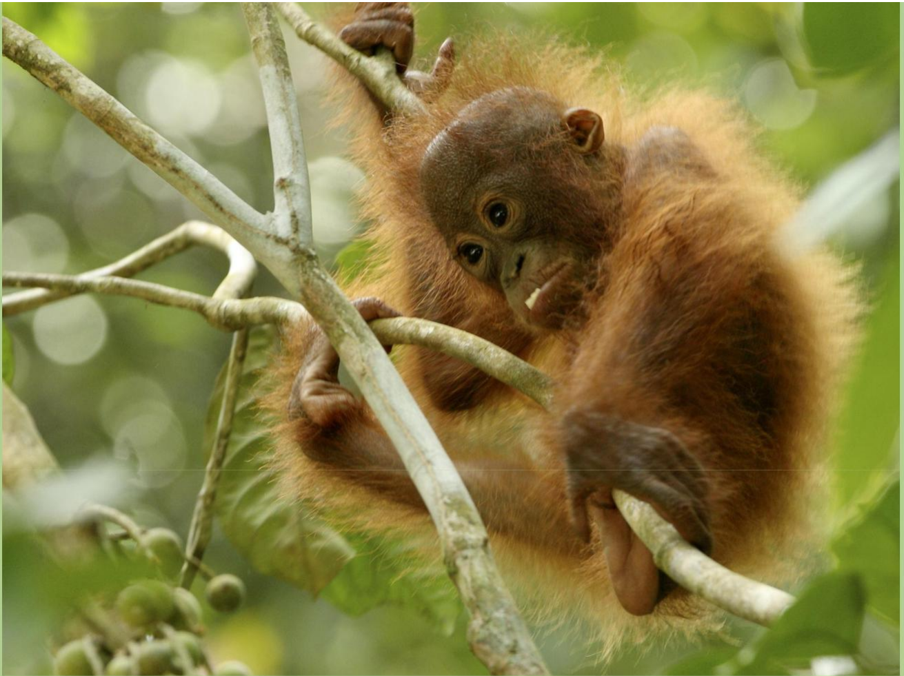
A baby orangutan named Bayas was featured in the BBC Seven Worlds One Planet episode. Bayas, along with his mother, Bibi, were among the most frequently studied orangutans in Gunung Palung this year.

COVID-19 then became a worldwide pandemic. As a result, in mid-March, GPOCP went virtual and we all learned to do our part to socially distance and #ActLikeAnOrangutan . Our Sustainable Livelihoods artisan groups joined forces to sew cloth masks at the onset of the pandemic. In total, they made over 6,000 masks to distribute throughout local villages. This generated a significant amount of income for the artisans, while also helping the community.