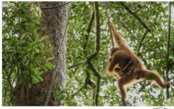
"The Wild Ride" by Tim Laman.

All orangutan prints are on sale through Tuesday, December 1. Buy an orangutan print today to support our cause, or purchase one to give as a gift! 📺