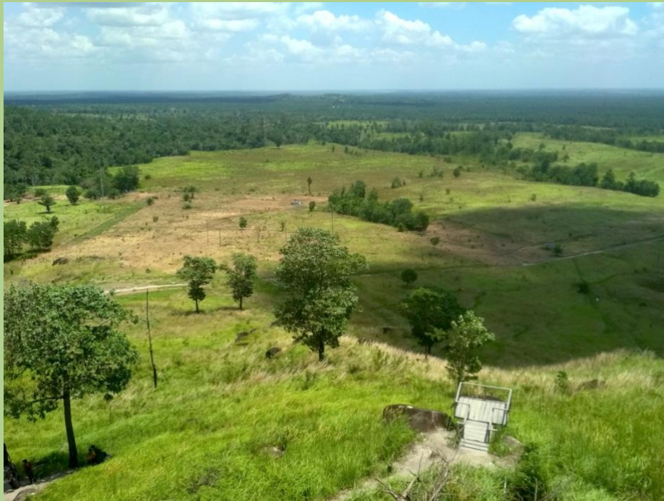
The Customary Forest in Belaban Rayak.

Now, almost every weekend Belaban Rayak has visitors that come to observe its beauty. People are drawn from the surrounding communities in the Ketapang and Kayong Utara Regencies. Hopefully, this area can become one of the tourist destinations in the Sungai Melayu District.