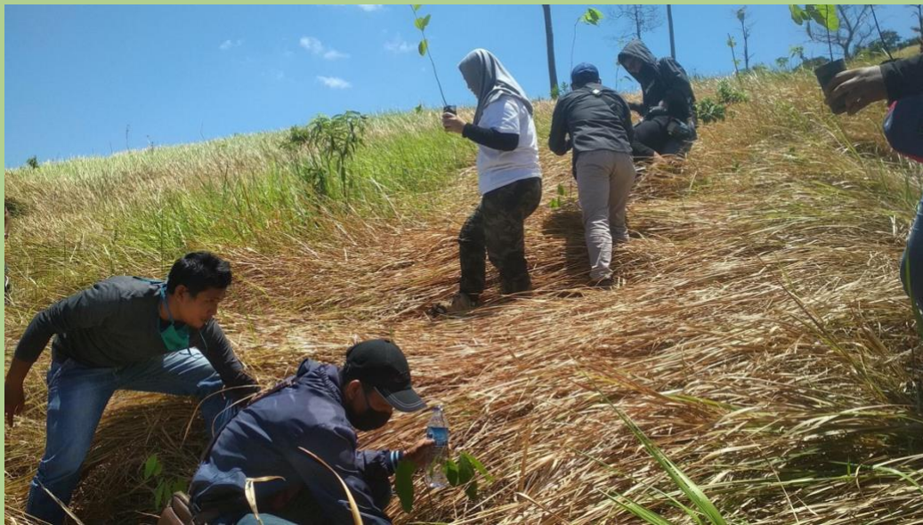
The seminar group plants trees in order to rehabilitate the land.

While here, seminar participants also were invited to help plant trees. Hopefully, the seedlings we planted will grow, and I can know that I've played a small part in rehabilitating this area.