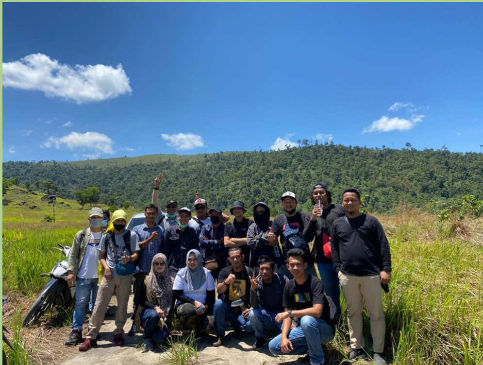
The Earthqualizer seminar drew participating journalists from around Indonesia.

On the first day of training, we discussed the very important role of journalists to speak out for nature, voicing environmental information. Then, on the second day, I, along with fellow journalists from the region and around the country, travelled to the Customary Forest of Bebalan Rayak Village, in the Sungai Melayu Rayak District, Ketapang Regency. I met local and national journalists and met directly with the Customary Forest Management Board for Bebalan Rayak Village.