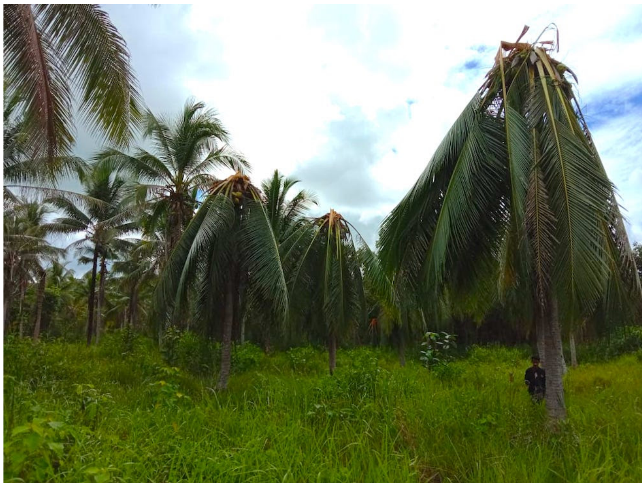
Coconut trees that were damaged by one or more orangutans in the Penjajaan Village.

Most respondents of the social survey who talked about Human-Orangutan Conflict said they would chase an orangutan away if it entered their garden by making noise, throwing objects, or sometimes by firing a gun. However, they stated that they would not shoot directly at or harm the orangutans, which we consider a conservation success deriving from education and outreach. Furthermore, practically all respondents were aware that orangutans are legally protected in Indonesia, and almost everyone agreed they should be protected. Common reasons provided for why they should be protected included that they are a rare species faced with extinction, are similar to humans in terms of intelligence, are important seed dispersers, and some even said that they don't disturb people or their gardens – all messages GPOCP tries to convey in our environmental education material! Many respondents also mentioned that orangutans should be protected to prevent people from hunting and killing them, and that they would report it to the authorities if they found protected animals that were hunted, traded, or kept as pets. From my own perspective, after immersing myself in understanding the local threats to orangutans and how GPOCP works to combat those threats, this is a huge conservation success in terms of positive perceptions of orangutans and wildlife.