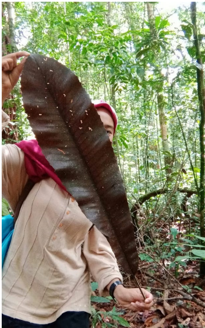
Sumi shows off a very large leaf found on the forest floor!

“If you think you're too small to have an impact, try going to bed with a mosquito in the room.”